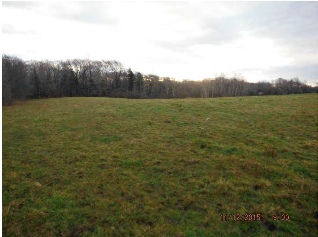
Photo No. 286 Data Point 606 Facing South Description: PEM Wetland Data Point 606 for Wetland A564.

Photo No. 285 Data Point 605 Facing West Description: Upland Data Point 605 for Wetland A562.