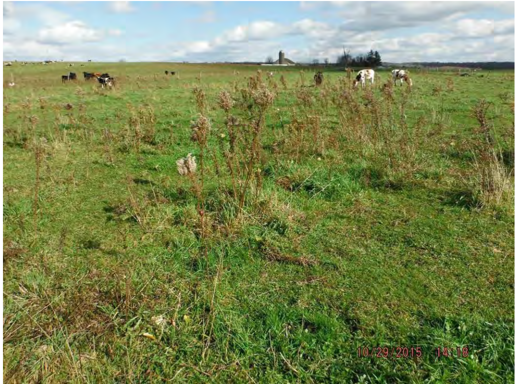
Photo No. 212 Data Point 525 Facing West / Upstream Description: Stream Data Point for Stream A504.

Photo No. 211 Data Point 524 Facing East Description: Upland Data Point 524 for Wetland A512.