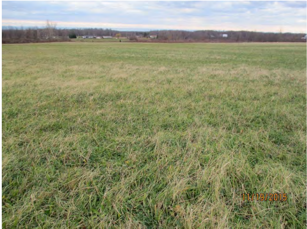
Photo No. 334 Data Point 652 Facing South Description: PFO Wetland Data Point 652 for Wetland A593.

Photo No. 333 Data Point 651 Facing North Description: Upland Data Point 651 adjacent to Wetland A592.