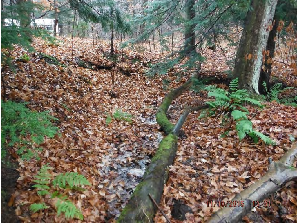
Photo No. 272 Data Point 587 Facing East / Right Bank to Left Bank Description: Stream Data Point for Stream A514.

Photo No. 271 Data Point 587 Facing South / Downstream Description: Stream Data Point for Stream A514.