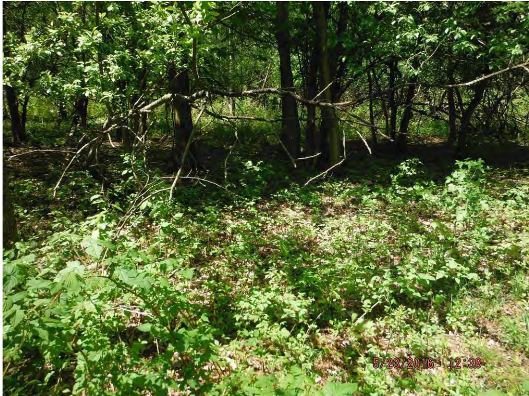
Photo No. 364 Data Point 670 Facing South Description: Overview of Wetland A599 from PFO Data Point 670.

Photo No. 363 Data Point 669 Facing West Description: Overview of Uplands adjacent to Wetland A598 from Data Point 669.