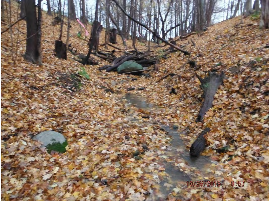
Photo No. 204 Data Point 520 Facing West / Downstream Description: Data Point 520 Stream Data Point for Stream A502.

Photo No. 203 Data Point 520 Facing East / Upstream Description: Data Point 520 Stream Data Point for Stream A502.