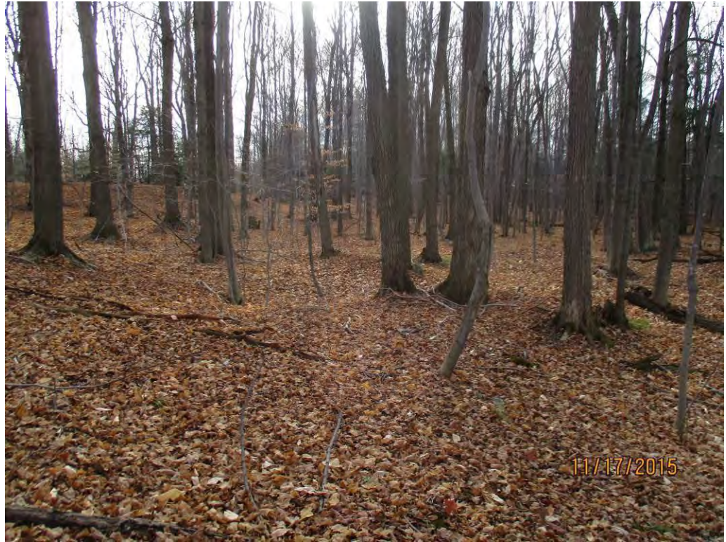
Photo No. 330 Data Point 648 Facing East Description: PSS Wetland Data Point 648 for Wetland A591.

Photo No. 329 Data Point 641 Facing East Description: Upland Data Point 641 adjacent to Wetland A587.