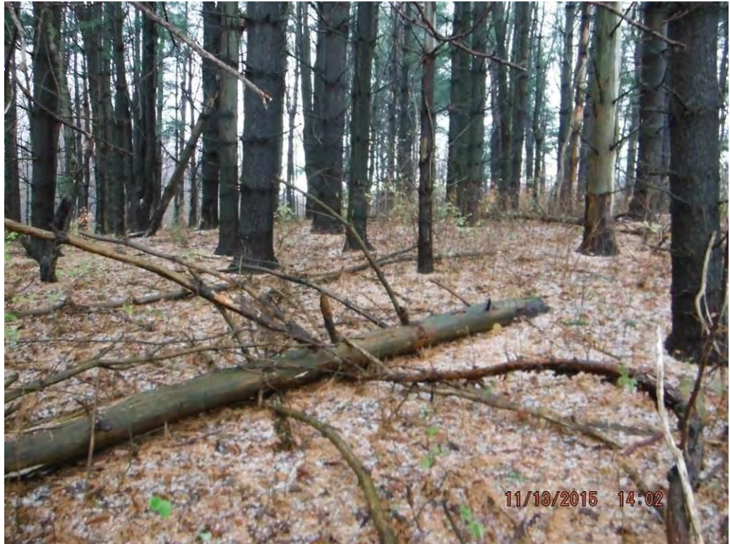
Photo No. 310 Data Point 624 Facing South / Upstream Description: Stream Data Point for Stream A523.

Photo No. 309 Data Point 623 Facing North Description: Upland Data Point 623 for Wetland A578.