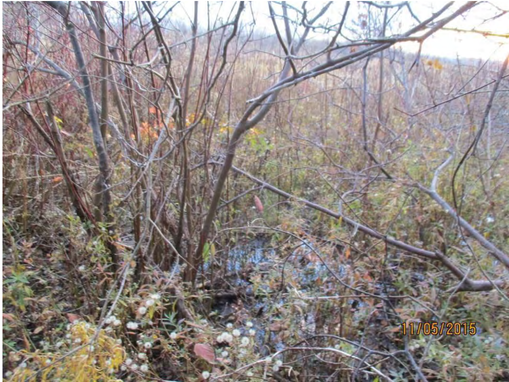
Photo No. 248 Data Point 569 Facing North Description: PEM Wetland Data Point 569 for Wetland A540.

Photo No. 247 Data Point 568 Facing South Description: PSS Wetland Data Point 568 for Wetland A538.