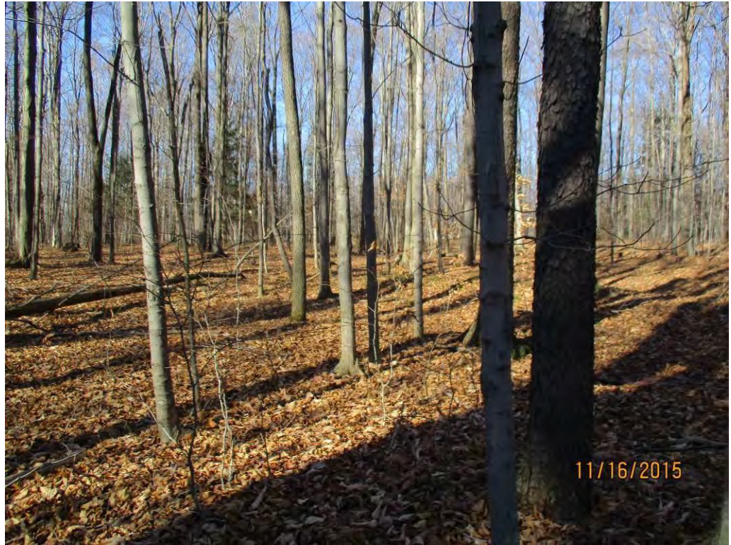
Photo No. 320 Data Point 632 Facing North Description: PFO/PSS Wetland Data Point 632 for Wetland A583.

Photo No. 319 Data Point 631 Facing East Description: Upland Data Point 631 adjacent to Wetland A582.