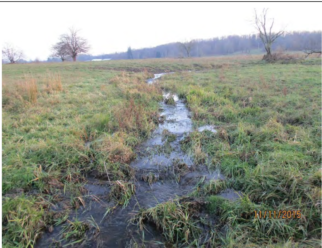
Photo No. 282 Data Point 603 Facing North / Downstream Description: Stream Data Point for Stream A518.

Photo No. 281 Data Point 603 Facing South / Upstream Description: Stream Data Point for Stream A518.