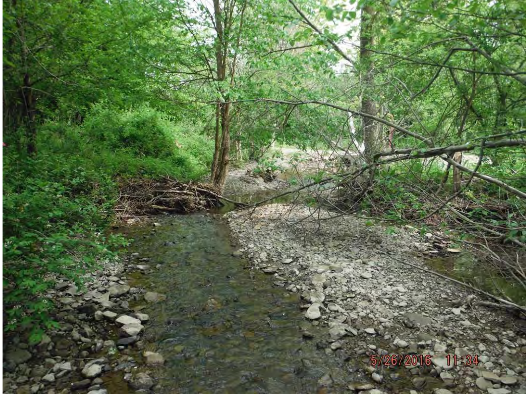
Photo No. 406 Data Point 707 Facing North / Right Bank to Left Bank Description: Stream Data Point for Stream A533.

Photo No. 405 Data Point 707 Facing East / Downstream Description: Stream Data Point for Stream A533.