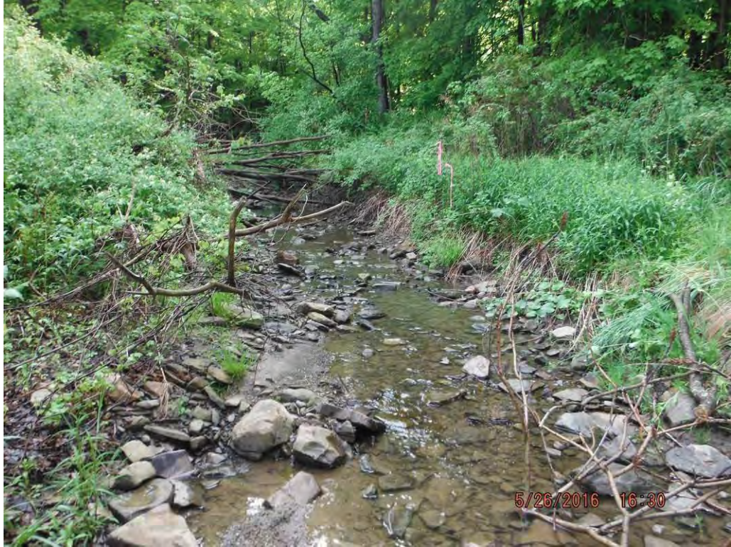
Photo No. 412 Data Point 712 Facing East / Downstream Description: Stream Data Point for Stream A534.

Photo No. 411 Data Point 712 Facing West / Upstream Description: Stream Data Point for Stream A534.