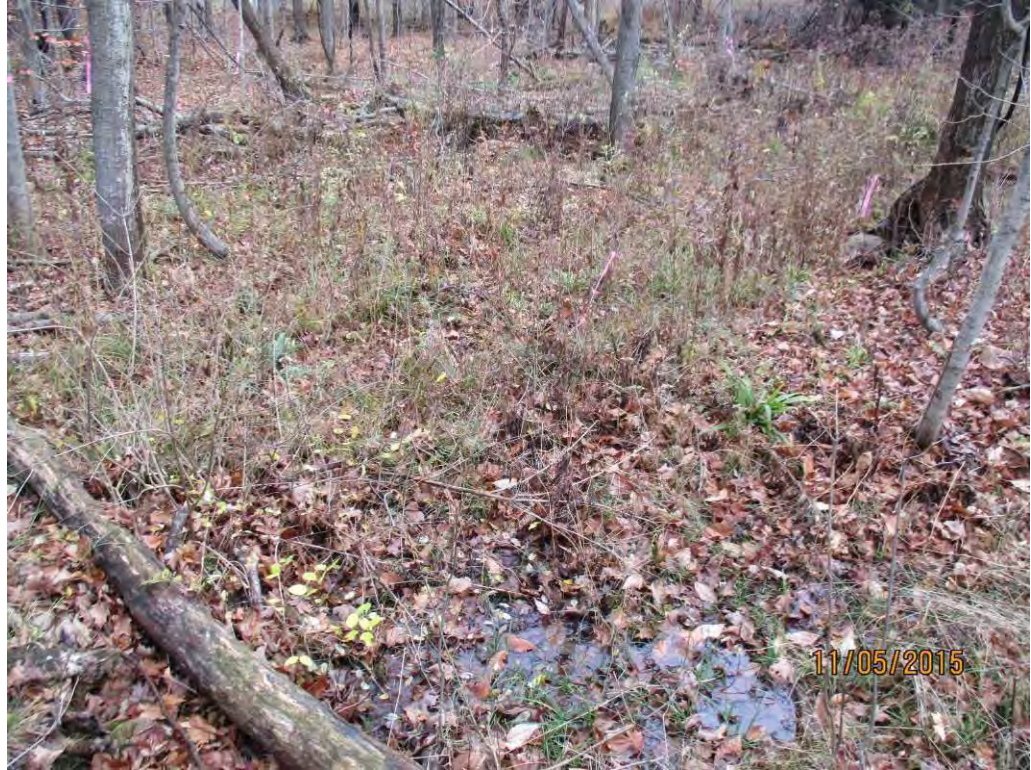
Photo No. 252 Data Point 573 Facing North / Upstream Description: Stream Data Point for Stream A511.

Photo No. 251 Data Point 572 Facing South Description: PEM Wetland Data Point 572 for Wetland A542.