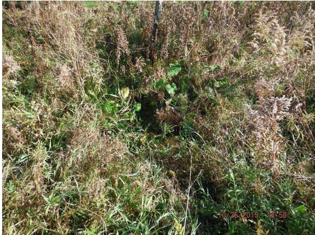
Photo No. 194 Data Point 505 Facing North Description: PEM Wetland Data Point 505 for Wetland A502

Photo No. 193 Data Point 504 Facing East / Right Bank to Left Bank Description: Stream Data Point for Stream A501.