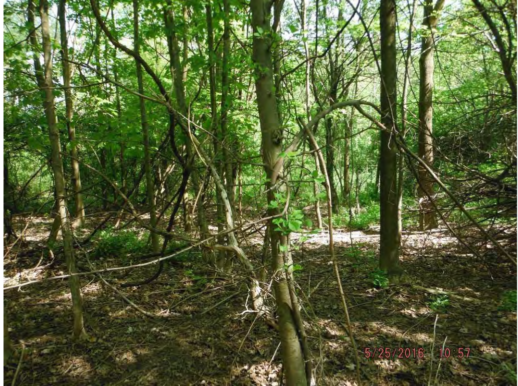
Photo No. 394 Data Point 697 Facing South Description: PFO Wetland Data Point 697 for Wetland A614.

Photo No. 393 Data Point 696 Facing North Description: Overview of Uplands adjacent to Wetland A613 from Data Point 696.