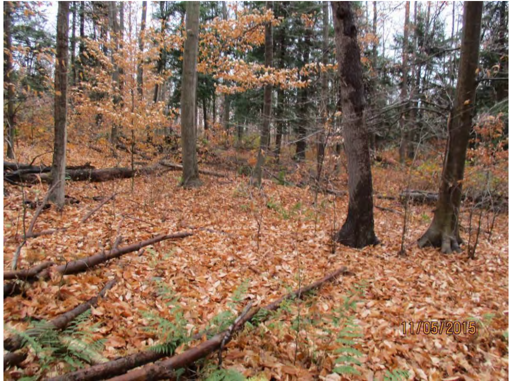
Photo No. 250 Data Point 571 Facing North Description: PEM Wetland Data Point 571 for Wetland A541.

Photo No. 249 Data Point 570 Facing South Description: Upland Data Point 570 adjacent to Wetland A540.