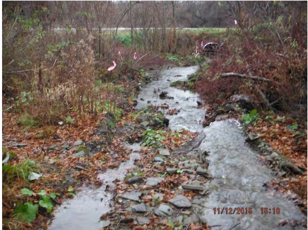
Photo No. 298 Data Point 612 Facing North / Right Bank to Left Bank Description: Stream Data Point for Stream A521.

Photo No. 297 Data Point 612 Facing East / Downstream Description: Stream Data Point for Stream A521.