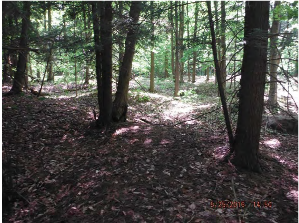
Photo No. 400 Data Point 703 Facing West Description: Overview of Wetland A615 from PSS Data Point 703.

Photo No. 399 Data Point 702 Facing South Description: Overview of Uplands adjacent to Wetland A616 from Data Point 702.