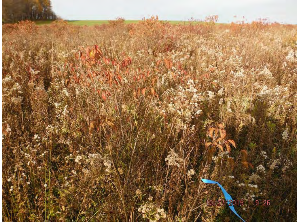
Photo No. 200 Data Point 511 Facing West Description: PEM Wetland Data Point 511 for Wetland A505

Photo No. 199 Data Point 510 Facing West Description: Upland Data Point 510 for Wetland A504