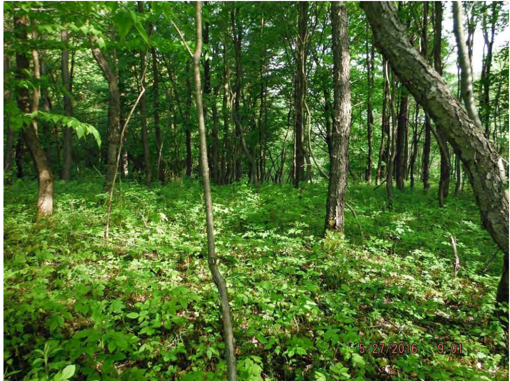
Photo No. 418 Data Point 718 Facing South Description: Overview of Wetland A622 from PFO Data Point 718.

Photo No. 417 Data Point 717 Facing North Description: Overview of Uplands adjacent to Wetland A617 from Data Point 717.