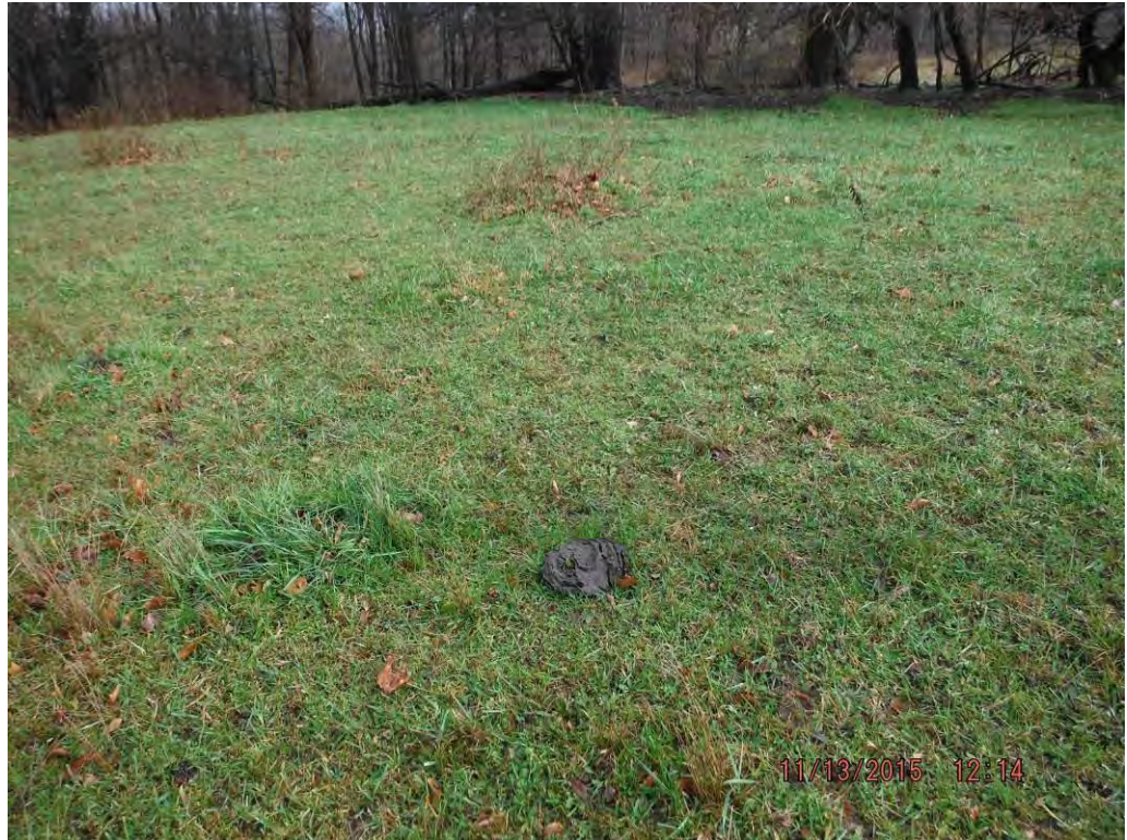
Photo No. 308 Data Point 622 Facing South Description: PSS Wetland Data Point 622 for Wetland A578.

Photo No. 307 Data Point 621 Facing East Description: Upland Data Point 621 adjacent to Wetland A573.