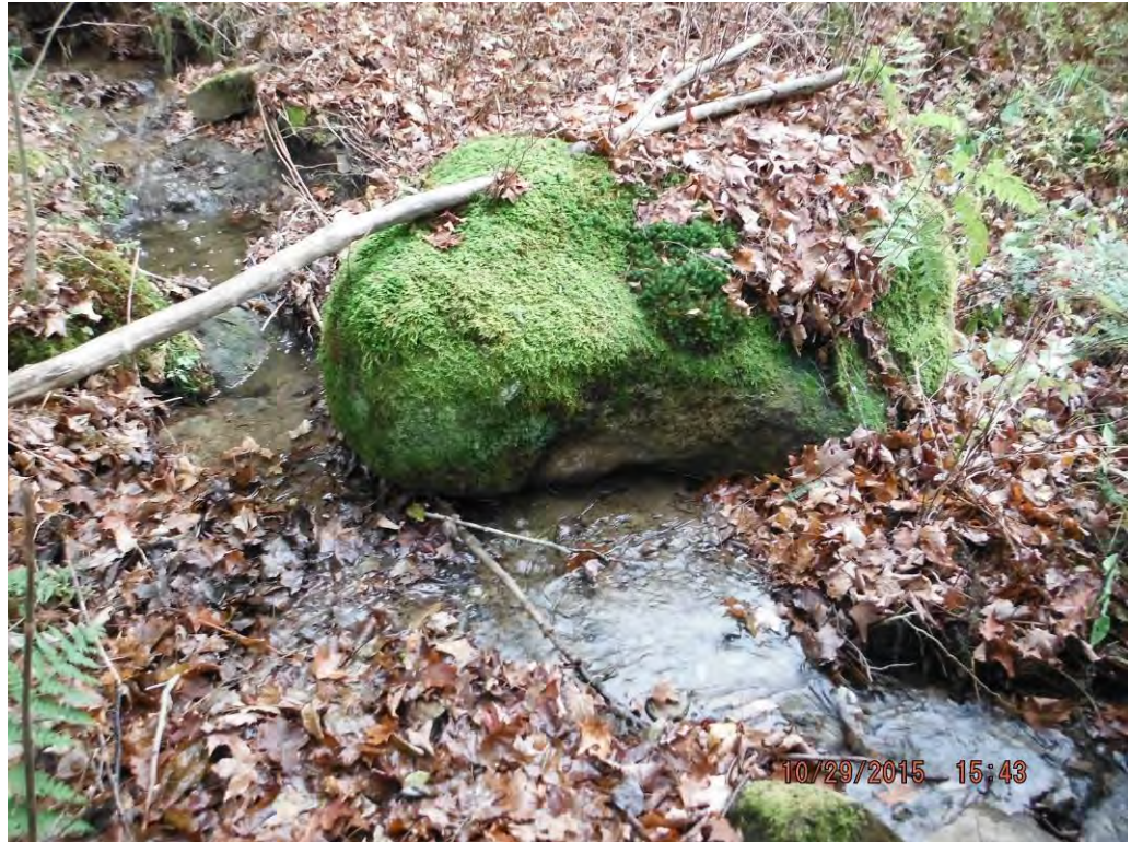
Photo No. 218 Data Point 527 Facing South / Upstream Description: Stream Data Point for Stream A506.

Photo No. 217 Data Point 526 Facing North / Right Bank to Left Bank Description: Stream Data Point for Stream A505.