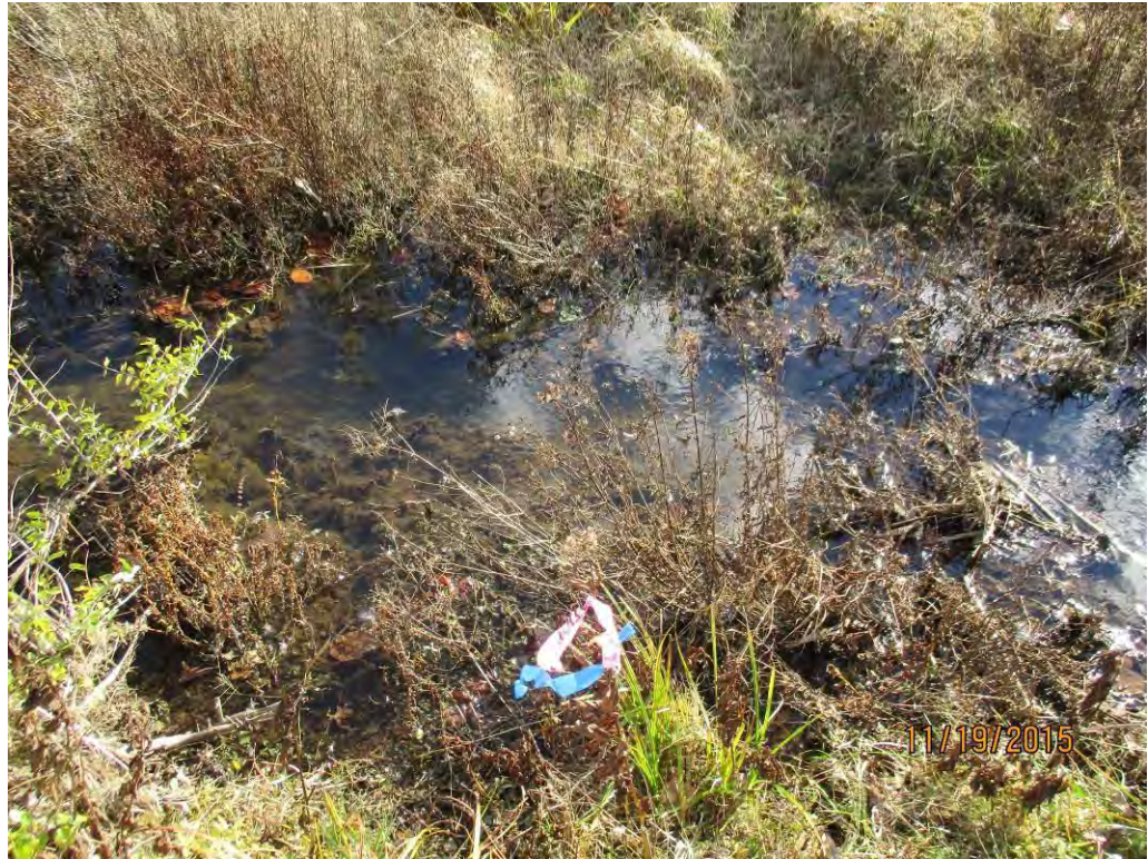
Photo No. 342 Data Point 657 Facing West / Upstream Description: Stream Data Point for Stream A527.

Photo No. 341 Data Point 656 Facing East / Right Bank to Left Bank Description: Stream Data Point for Stream A526.