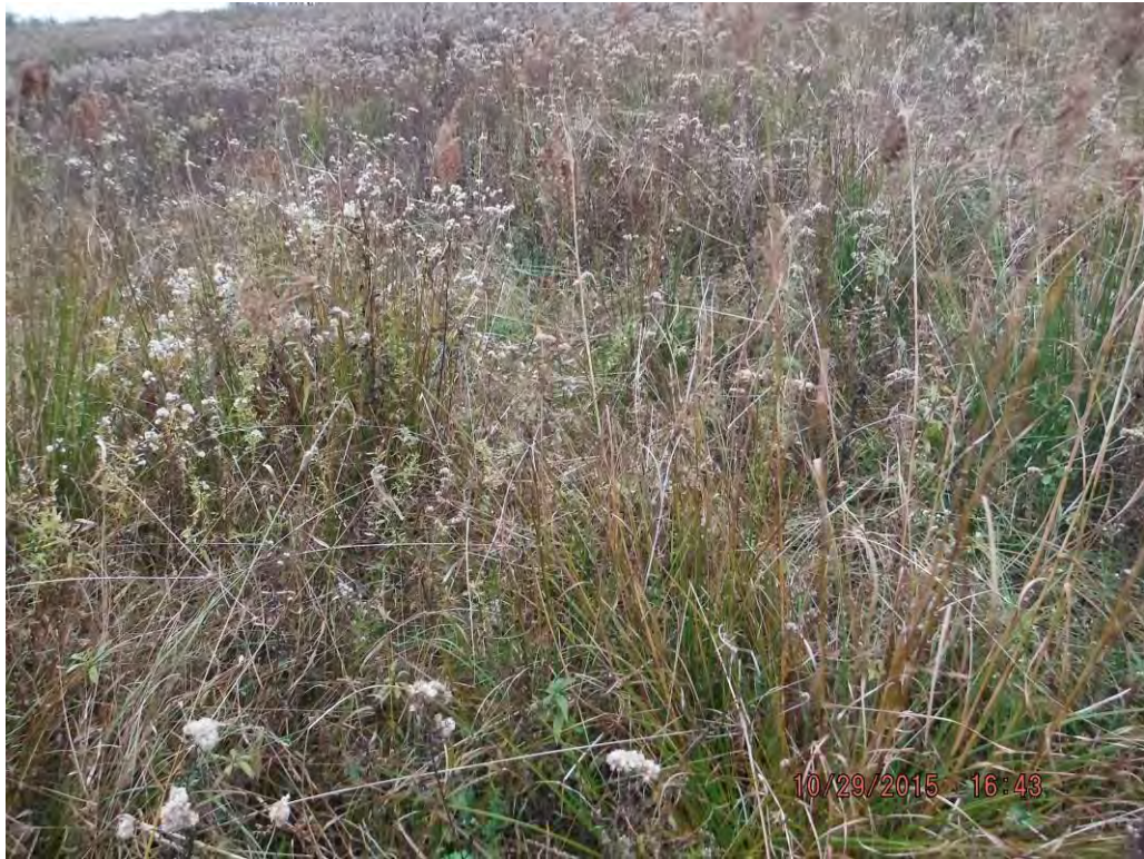
Photo No. 222 Data Point 529 Facing South Description: Upland Data Point 529 for Wetland A516.

Photo No. 221 Data Point 528 Facing South Description: PEM Wetland Data Point 528 for Wetland A515.