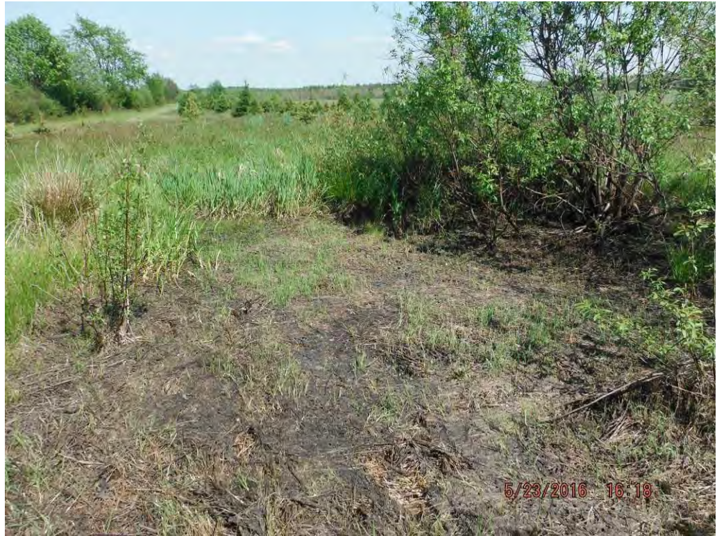
Photo No. 370 Data Point 676 Facing East Description: Upland Data Point 676 adjacent to Wetland A602.

Photo No. 369 Data Point 675 Facing East Description: Overview of Wetland A602 from PEM Data Point 675.