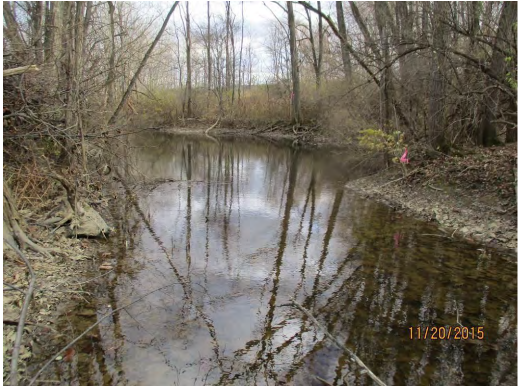
Photo No. 344 Data Point 657 Facing South / Right Bank to Left Bank Description: Stream Data Point for Stream A527.

Photo No. 343 Data Point 657 Facing East / Downstream Description: Stream Data Point for Stream A527.