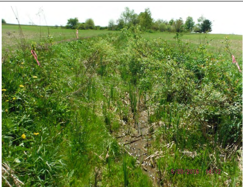
Photo No. 358 Data Point 666 Facing North / Downstream Description: Stream Data Point for Stream A529.

Photo No. 357 Data Point 666 Facing South / Upstream Description: Stream Data Point for Stream A529.