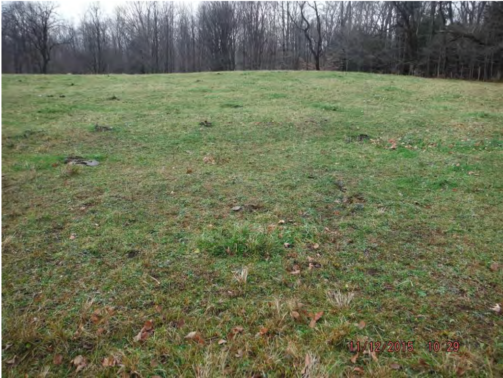
Photo No. 288 Data Point 608 Facing West / Upstream Description: Stream Data Point for Stream A519.

Photo No. 287 Data Point 607 Facing North Description: Upland Data Point 607 adjacent to Wetland A564.