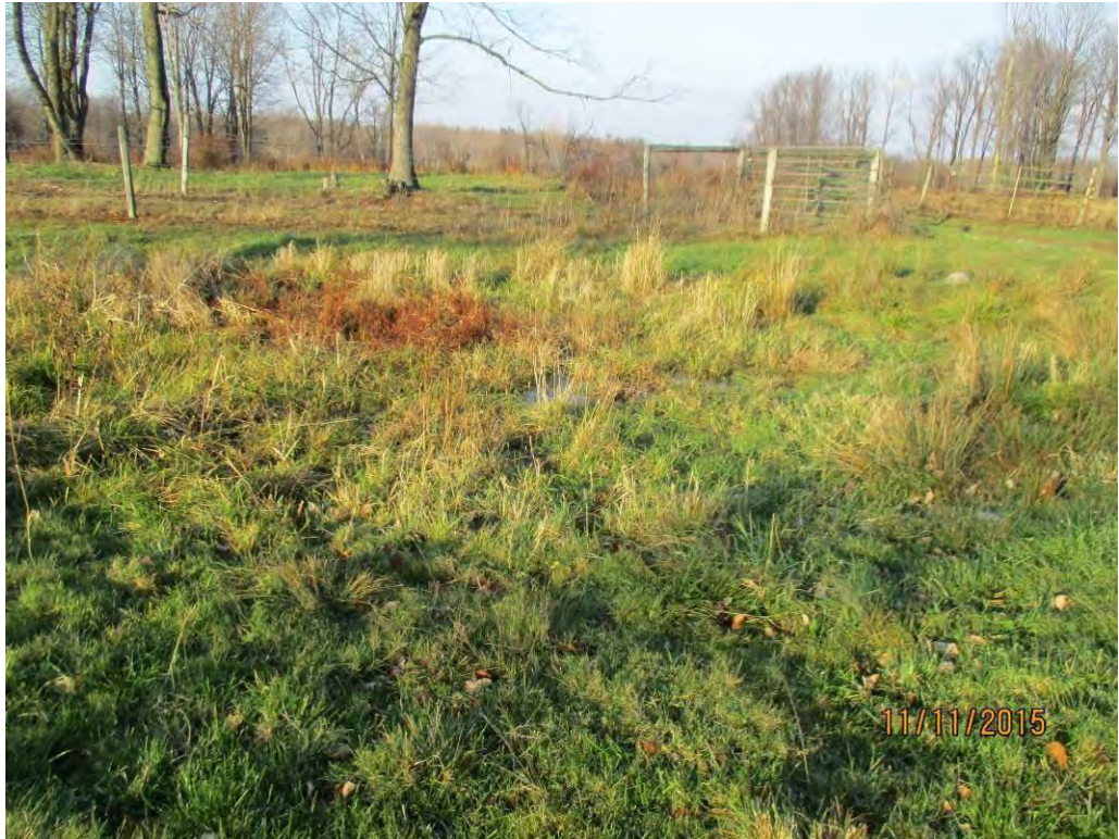
Photo No. 278 Data Point 600 Facing West Description: Upland Data Point 600 adjacent to Wetland A560.

Photo No. 277 Data Point 599 Facing North Description: PEM Wetland Data Point 599 for Wetland A560.