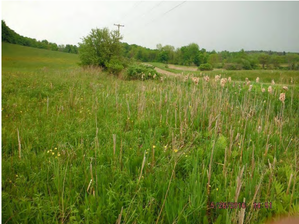
Photo No. 410 Data Point 711 Facing West Description: Overview of Uplands adjacent to Wetland A620 from Data Point 711.

Photo No. 409 Data Point 710 Facing West Description: Overview of Wetland A620 from PEM Data Point 710.