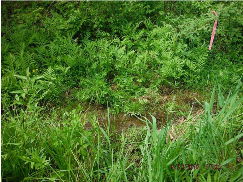
Photo No. 422 Data Point 720 Facing West / Upland Description: Ditch Data Point for Jurisdictional Ditch A504.

Photo No. 421 Data Point 719 Facing West / Right Bank to Left Bank Description: Stream Data Point for Stream A535.