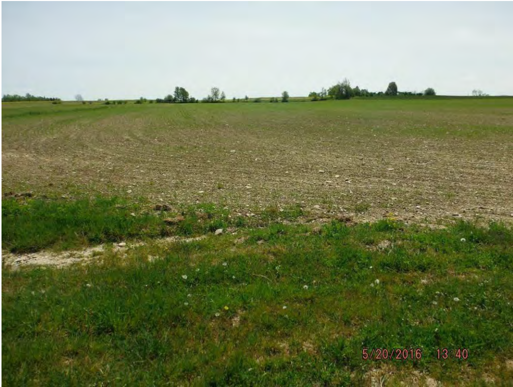
Photo No. 354 Data Point 665 Facing South / Upstream Description: Ditch Data Point for Jurisdictional Ditch A501.

Photo No. 353 Data Point 664 Facing South Description: Overview of Uplands Adjacent to Wetland A597 from Data Point 664.