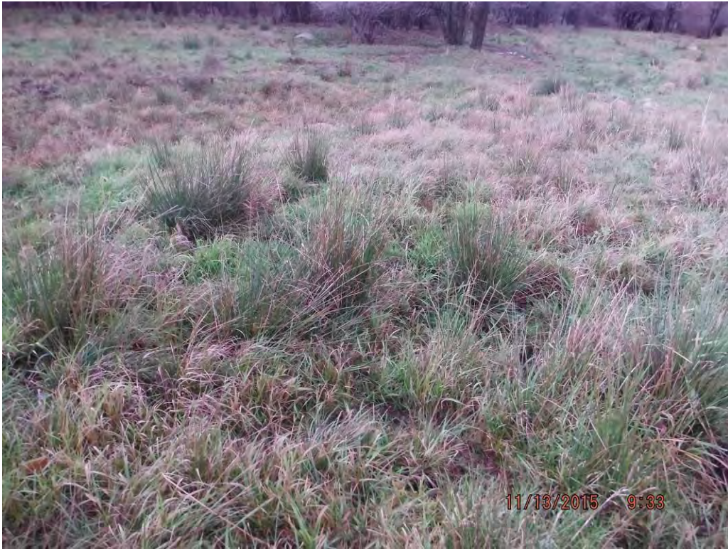
Photo No. 302 Data Point 618 Facing South Description: Upland Data Point 618 adjacent to Wetland A570.

Photo No. 301 Data Point 617 Facing North Description: PEM Wetland Data Point for Wetland A570.