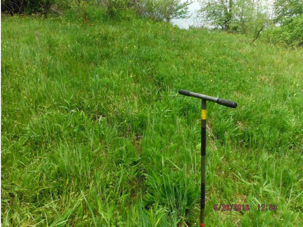
Photo No. 408 Data Point 709 Facing West Description: Overview of Uplands adjacent to Wetland A619 from Data Point 709.

Photo No. 407 Data Point 708 Facing North Description: PEM Wetland Data Point 708 for Wetland A619.