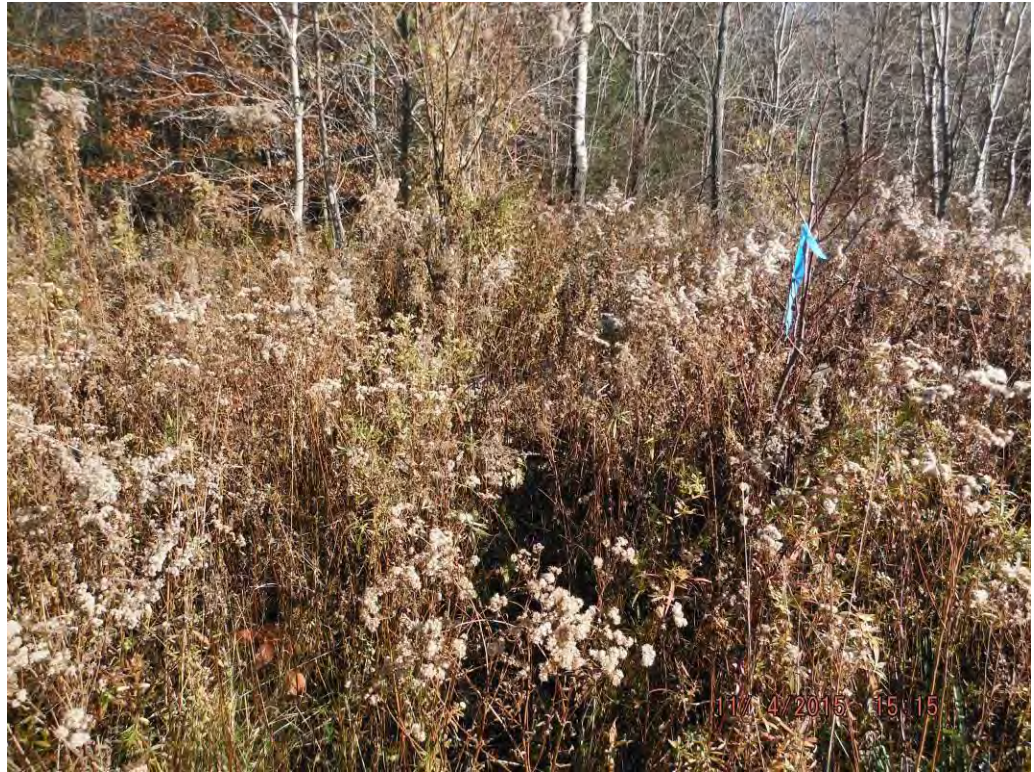
Photo No. 244 Data Point 560 Facing North Description: Upland Data Point 560 adjacent to Wetland A534.

Photo No. 243 Data Point 559 Facing East Description: PEM Wetland Data Point 559 for Wetland A534.