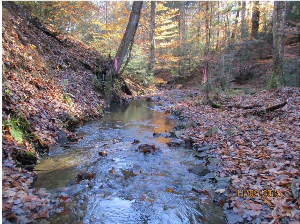
Photo No. 236 Data Point 547 Facing North / Right Bank to Left Bank Description: Stream Data Point for Stream A509.

Photo No. 235 Data Point 547 Facing East / Downstream Description: Stream Data Point for Stream A509.