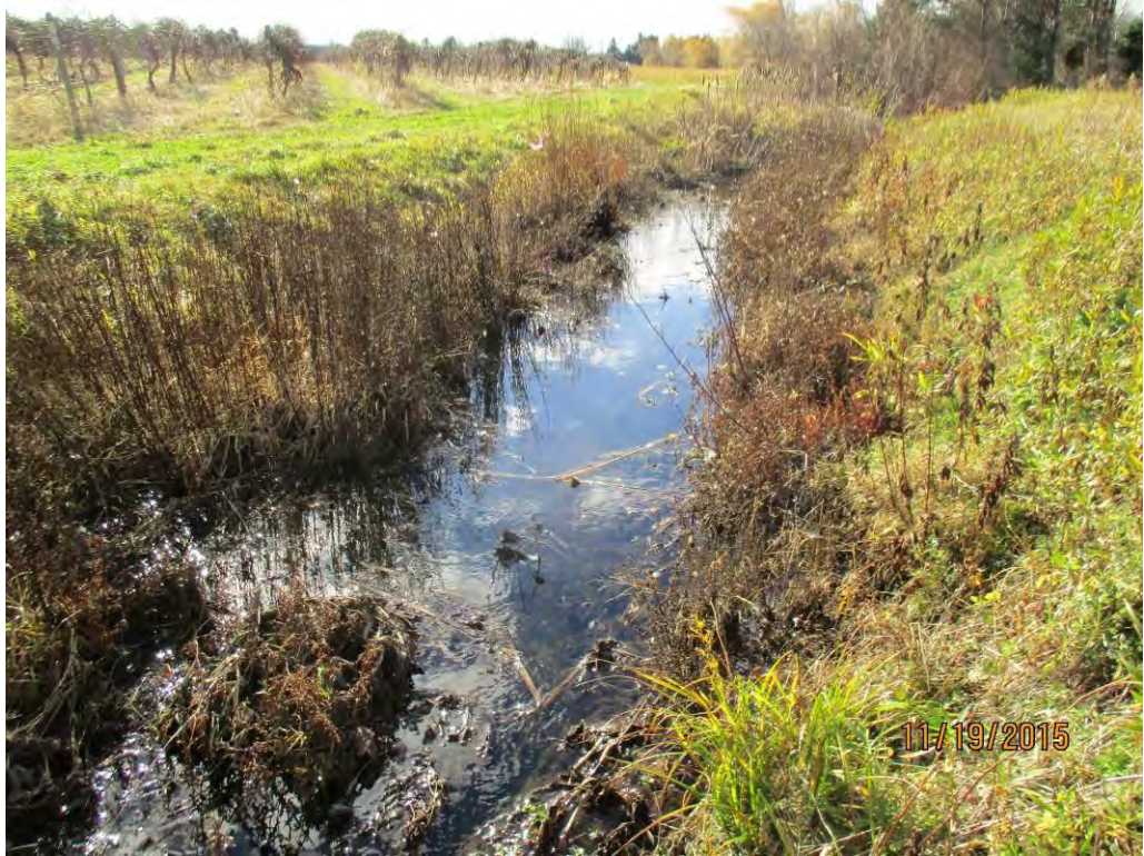
Photo No. 340 Data Point 656 Facing North / Downstream Description: Stream Data Point for Stream A526.

Photo No. 339 Data Point 656 Facing South / Upstream Description: Stream Data Point for Stream A526.