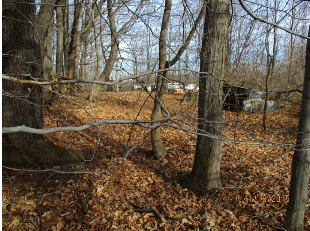
Photo No. 328 Data Point 640 Facing South Description: PFO/PSS Wetland Data Point 640 for Wetland A587.

Photo No. 327 Data Point 639 Facing South Description: Upland Data Point 639 adjacent to Wetland A586.