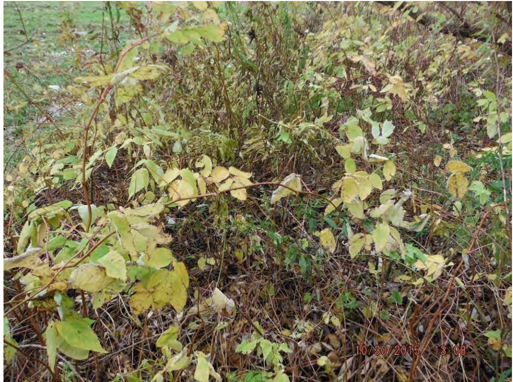
Photo No. 228 Data Point 535 Facing West Description: PEM Wetland Data Point 535 for Wetland A518.

Photo No. 227 Data Point 534 Facing South Description: Upland Data Point 534 adjacent to Wetland A517.