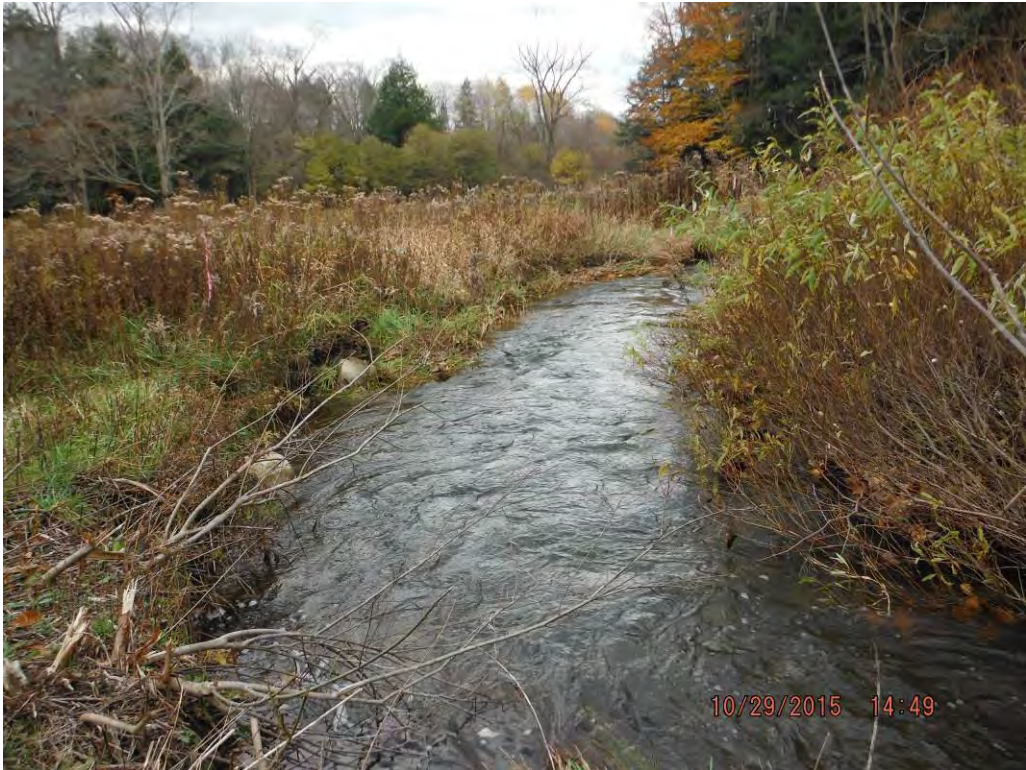
Photo No. 214 Data Point 525 Facing South / Right Bank to Left Bank Description: Stream Data Point for Stream A504.

Photo No. 213 Data Point 525 Facing East / Downstream Description: Stream Data Point for Stream A504.