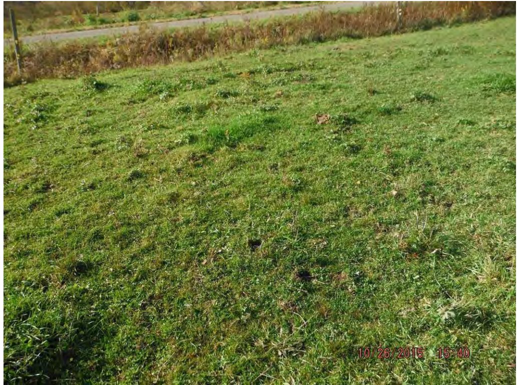
Photo No. 196 Data Point 507 Facing West Description: PEM Wetland Data Point 507 for Wetland A503.

Photo No. 195 Data Point 506 Facing West Description: Upland Data Point for Wetland A503