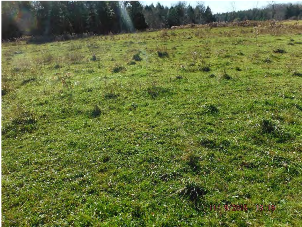
Photo No. 260 Data Point 577 Facing South Description: PEM Wetland Data Point 577 for Wetland A544.

Photo No. 259 Data Point 576 Facing South Description: Upland Data Point 576 adjacent to Wetland A543.