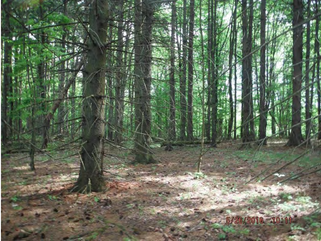
Photo No. 404 Data Point 707 Facing West / Upstream Description: Stream Data Point for Stream A533.

Photo No. 403 Data Point 706 Facing East Description: Overview of Uplands adjacent to Wetland A618 from Data Point 706.