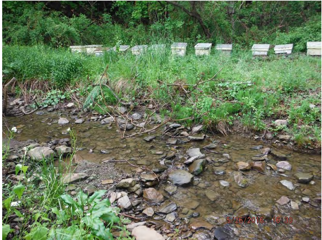
Photo No. 414 Data Point 714 Facing West Description: PEM Wetland Data Point for Wetland A621.

Photo No. 413 Data Point 712 Facing North / Right Bank to Left Bank Description: Stream Data Point for Stream A534.