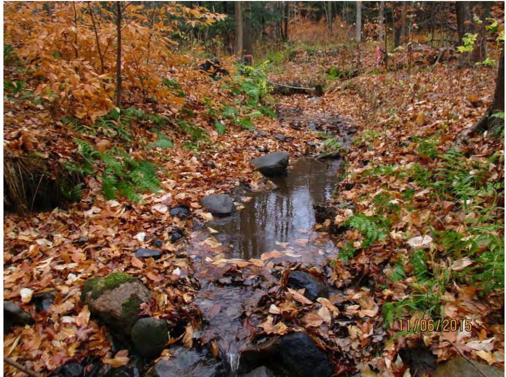
Photo No. 256 Data Point 574 Facing South / Downstream Description: Stream Data Point for Stream A512.

Photo No. 255 Data Point 574 Facing North / Upstream Description: Stream Data Point for Stream A512.