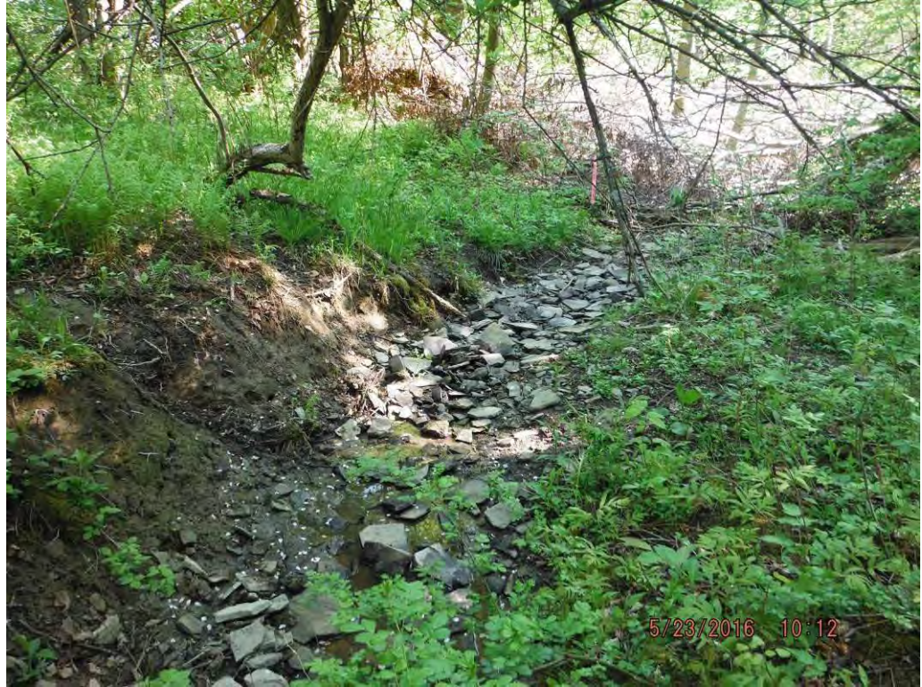
Photo No. 362 Data Point 668 Facing East Description: PFO Wetland Data Point 668 for Wetland A598.

Photo No. 361 Data Point 667 Facing North / Downstream Description: Stream Data Point for Stream A530.