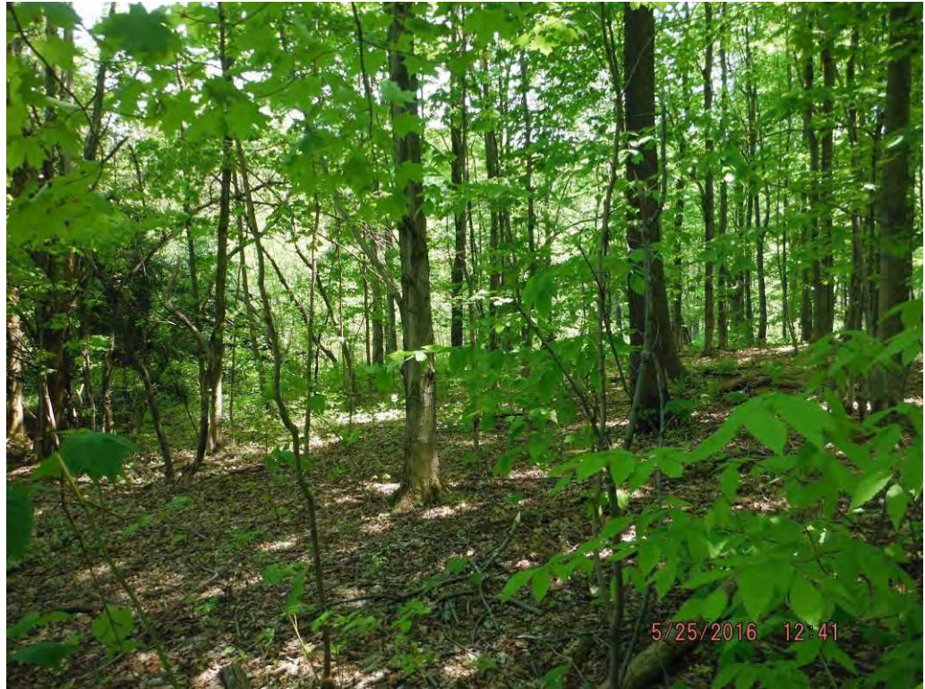
Photo No. 398 Data Point 701 Facing West Description: Overview of Wetland A616 from PEM Data Point 701.

Photo No. 397 Data Point 700 Facing East Description: Overview of Uplands adjacent to Wetland A615 from Data Point 700.