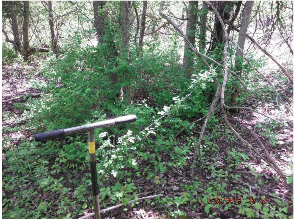
Photo No. 366 Data Point 672 Facing East Description: Overview of Wetland A600 from PEM Data Point 672.

Photo No. 365 Data Point 671 Facing East Description: Upland Data Point 671 adjacent to wetland A599.