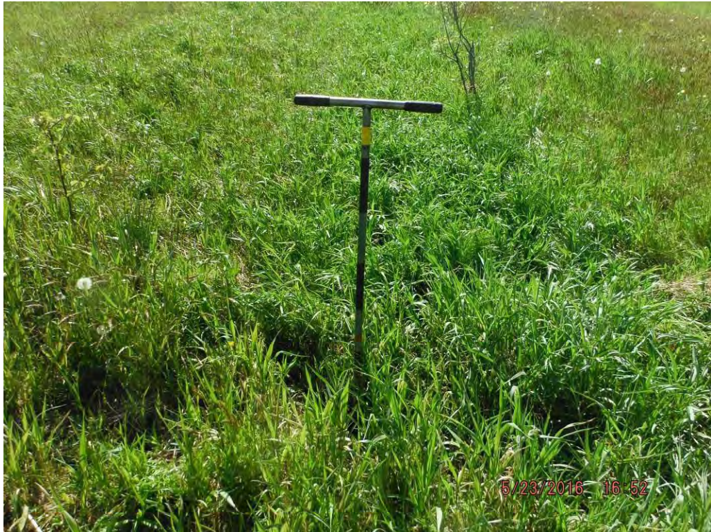
Photo No. 372 Data Point 678 Facing East Description: Overview of Uplands adjacent to Wetland A603 from Data Point 678.

Photo No. 371 Data Point 677 Facing West Description: PEM Wetland Data Point 677 for Wetland A603.