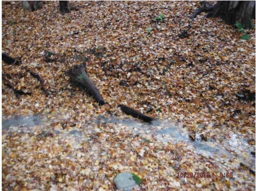
Photo No. 206 Data Point 521 Facing North Description: PEM Wetland Data Point 521 for Wetland A511

Photo No. 205 Data Point 520 Facing South / Right Bank to Left Bank Description: Data Point 520 Stream Data Point for Stream A502.