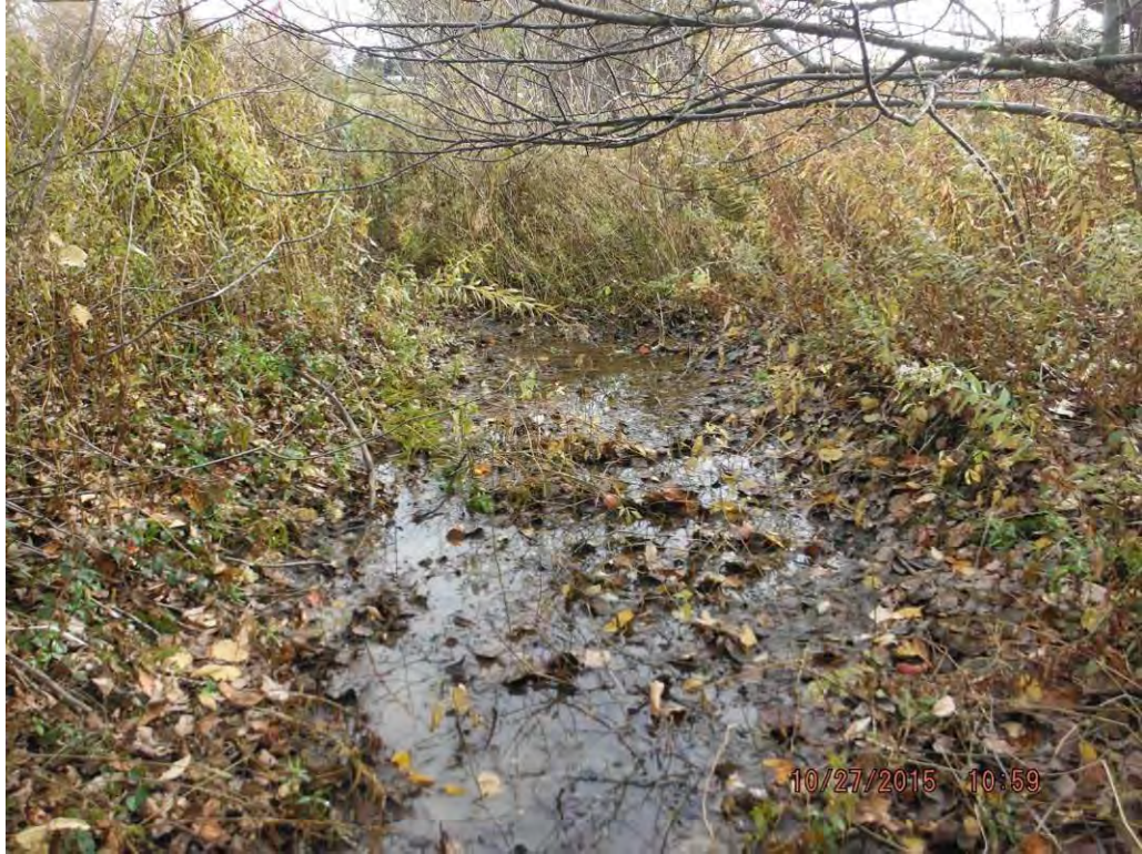
Photo No. 202 Data Point 514 Facing North Description: PEM Data Point 514 for Wetland A508.

Photo No. 201 Data Point 512 Facing West Description: PEM Data Point 512 for Wetland A506.