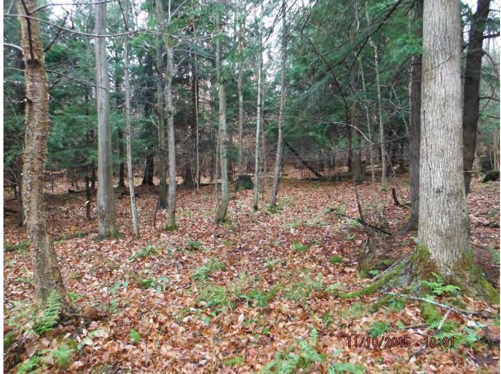
Photo No. 268 Data Point 585 Facing West Description: PFO Wetland Data Point 585 for Wetland A549.

Photo No. 267 Data Point 584 Facing West Description: Upland Data Point 584 adjacent to Wetland A548.