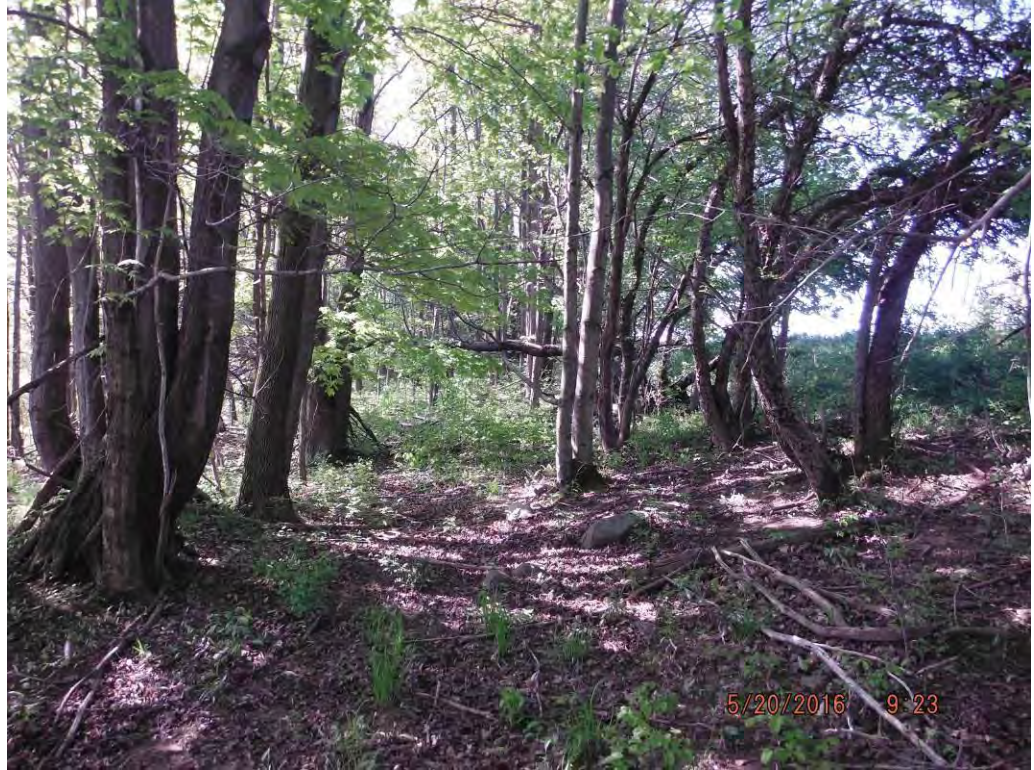
Photo No. 352 Data Point 663 Facing East Description: Overview of Wetland A597 from PSS Data Point 663.

Photo No. 351 Data Point 662 Facing South Description: Overview of Uplands adjacent to Wetland A596 from Data Point 662.