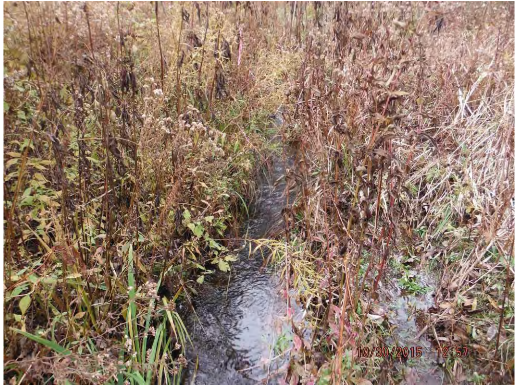
Photo No. 224 Data Point 532 Facing South / Downstream Description: Stream Data Point for Stream A508.

Photo No. 223 Data Point 532 Facing North / Upstream Description: Stream Data Point for Stream A508.