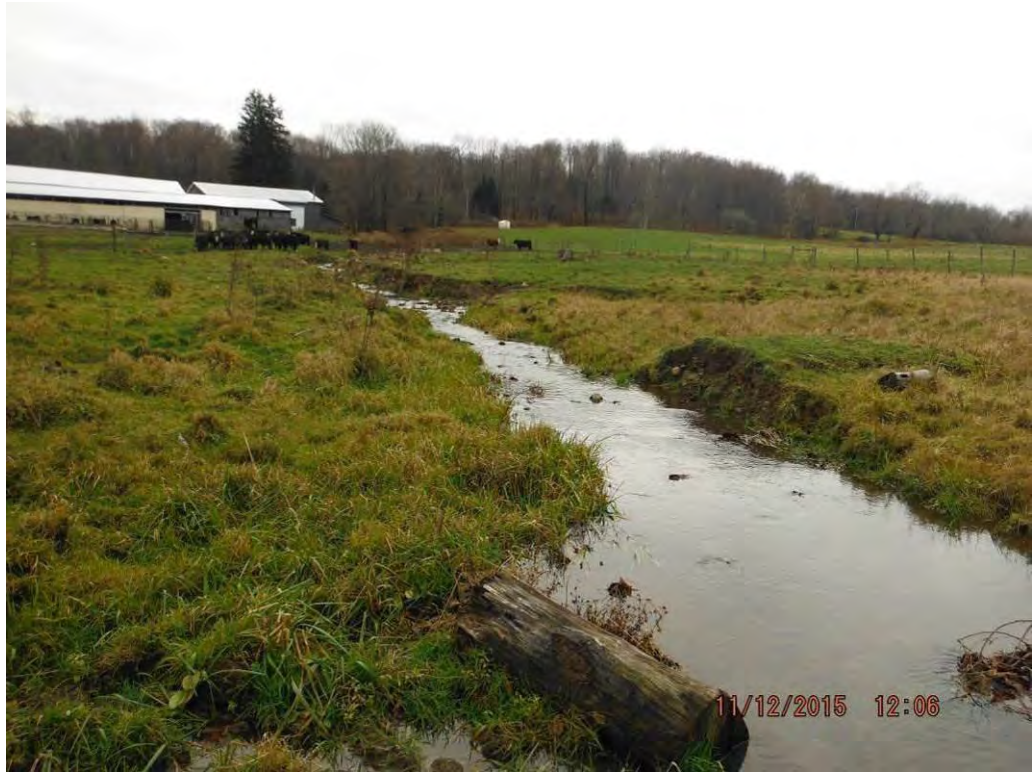
Photo No. 292 Data Point 609 Facing East / Downstream Description: Stream Data Point for Stream A520.

Photo No. 291 Data Point 609 Facing West / Upstream Description: Stream Data Point for Stream A520.