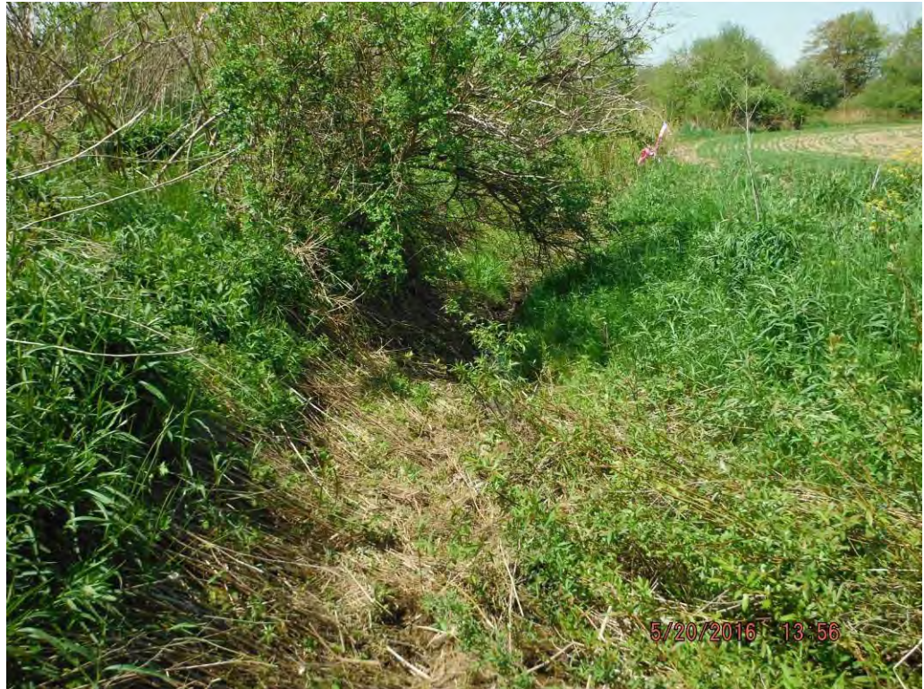
Photo No. 356 Data Point 665 Facing West / Right Bank to Left Bank Description: Ditch Data Point for Jurisdictional Ditch A501.

Photo No. 355 Data Point 665 Facing North / Downstream Description: Ditch Data Point for Jurisdictional Ditch A501.