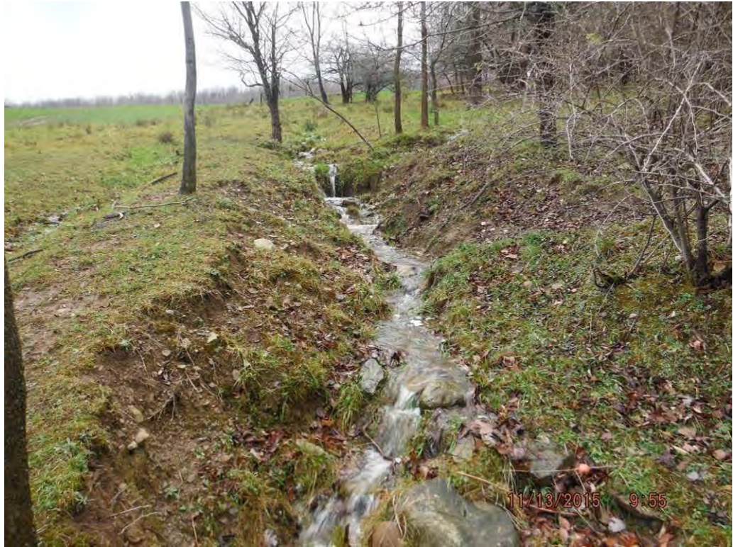
Photo No. 304 Data Point 619 Facing North / Downstream Description: Stream Data Point for Stream A522.

Photo No. 303 Data Point 619 Facing South / Upstream Description: Stream Data Point for Stream A522.