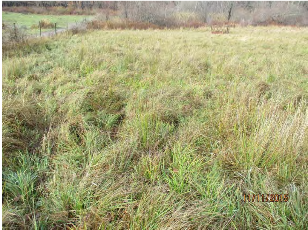
Photo No. 274 Data Point 596 Facing South Description: Upland Data Point 596 adjacent to Wetland A552.

Photo No. 273 Data Point 595 Facing North Description: PEM Wetland Data Point 595 for Wetland A552.