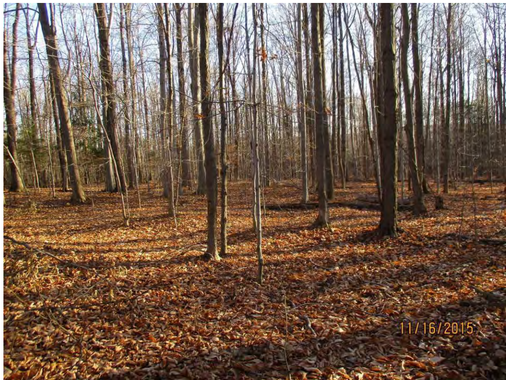
Photo No. 322 Data Point 634 Facing South Description: PSS Wetland Data Point 634 for Wetland A584.

Photo No. 321 Data Point 633 Facing West Description: Upland Data Point 633 adjacent to Wetland A583.