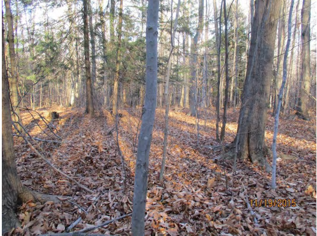
Photo No. 336 Data Point 654 Facing West Description: PFO Wetland Data Point 654 for Wetland A594.

Photo No. 335 Data Point 653 Facing North Description: Upland Data Point 653 for Wetlands A593 and A594.