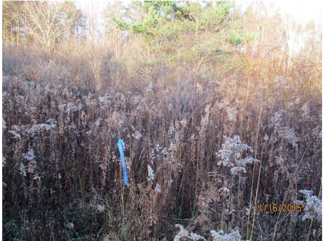
Photo No. 324 Data Point 636 Facing West Description: PFO/PSS Wetland Data Point 636 for Wetland A585.

Photo No. 323 Data Point 635 Facing North Description: Upland Data Point 635 adjacent to Wetland A584.