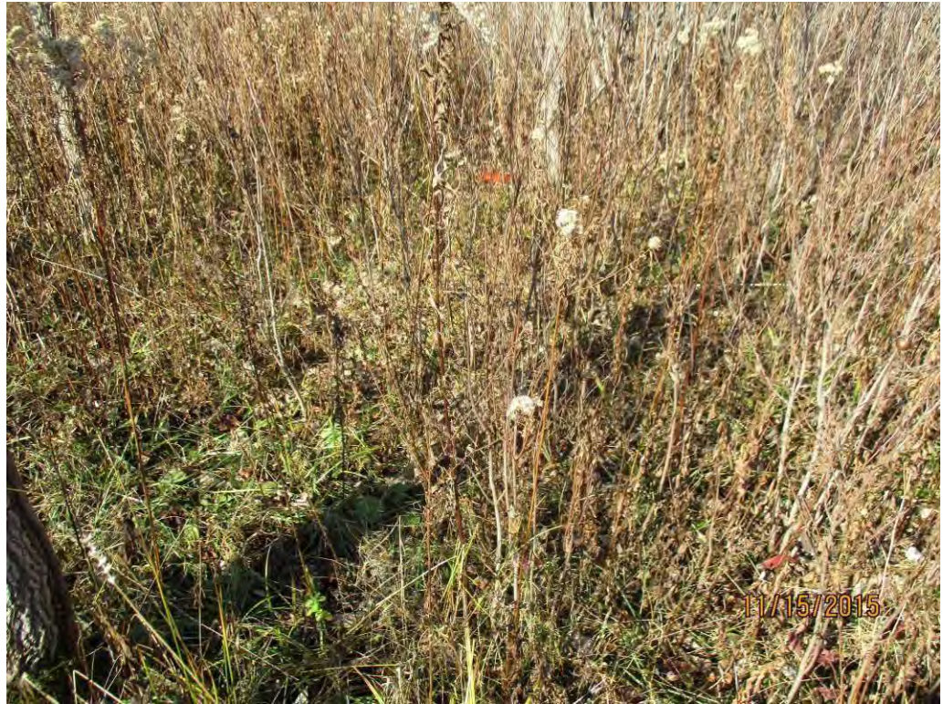
Photo No. 318 Data Point 630 Facing West Description: PFO/PSS Wetland Data Point 630 for Wetland A582.

Photo No. 317 Data Point 629 Facing South Description: Upland Data Point 629 adjacent to Wetland A581.