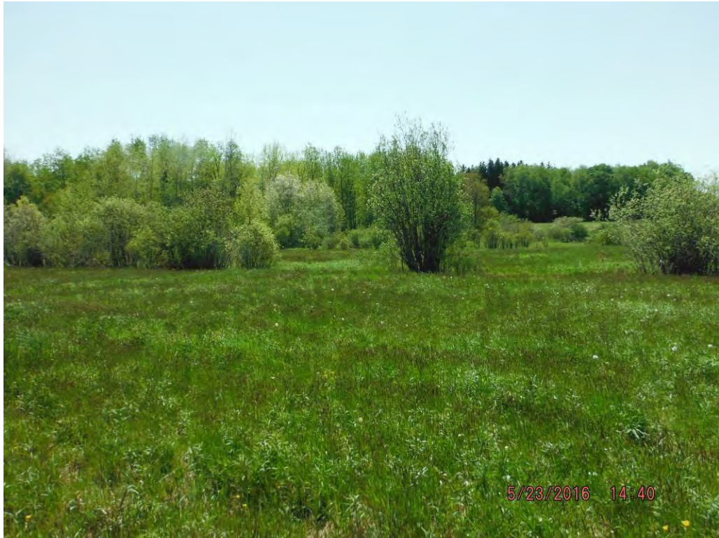
Photo No. 368 Data Point 674 Facing North Description: Overview of Wetland A601 from PSS Data Point 674.

Photo No. 367 Data Point 673 Facing West Description: Overview of Uplands adjacent to Wetland A600 and Wetland A601 from Data Point 673.