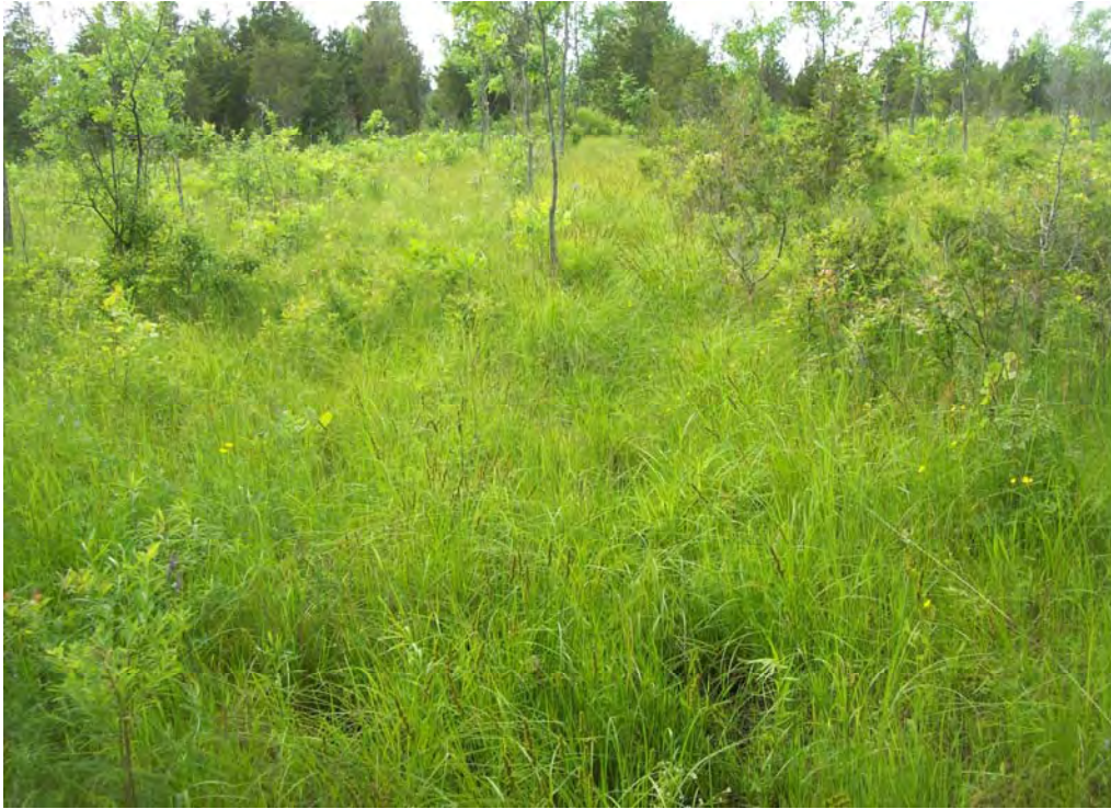
Figure 4.4 Upstream Grassy Swale Reach of Watercourse B