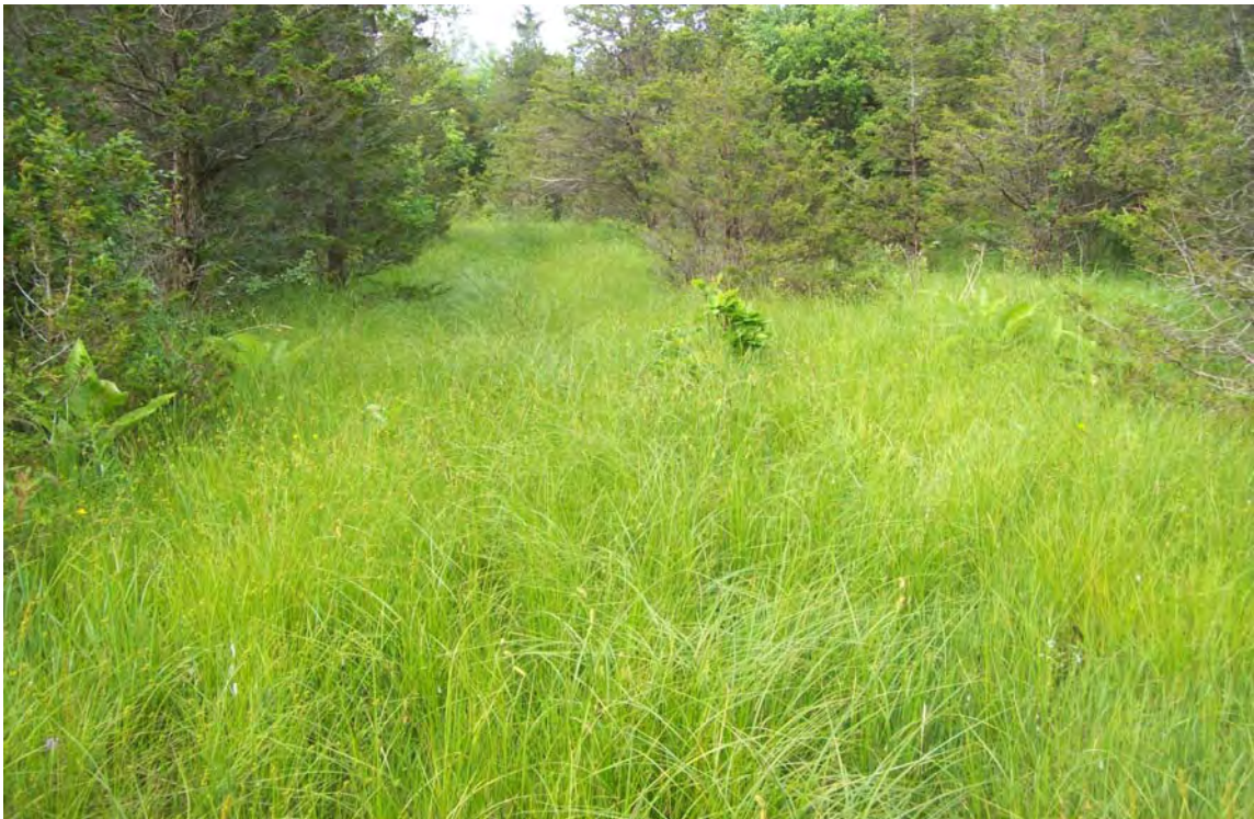
Figure 4.5 Lower Reaches of Watercourse B Adjacent to the Project Site