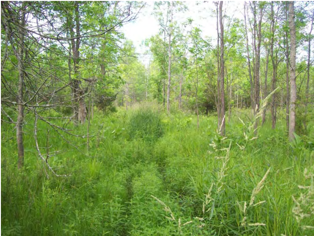
Figure 4.3 Watercourse A South of the Project Site