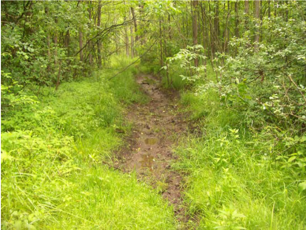
Figure 4.2 Watercourse A South of the Project Site