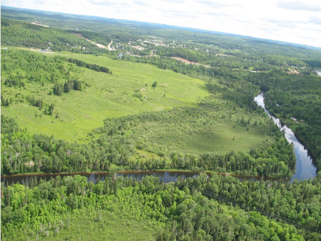
Figure 2.1 Photograph of Project Location, Unevaluated Wetland and Magnetawan River South of the Project Location

MNR also provided several photographs of the site taken from an airplane in June 2010. One of these photographs, depicting the southern end of the Project location, the wetland to the south and the Magnetawan River, is shown in Figure 2.1.