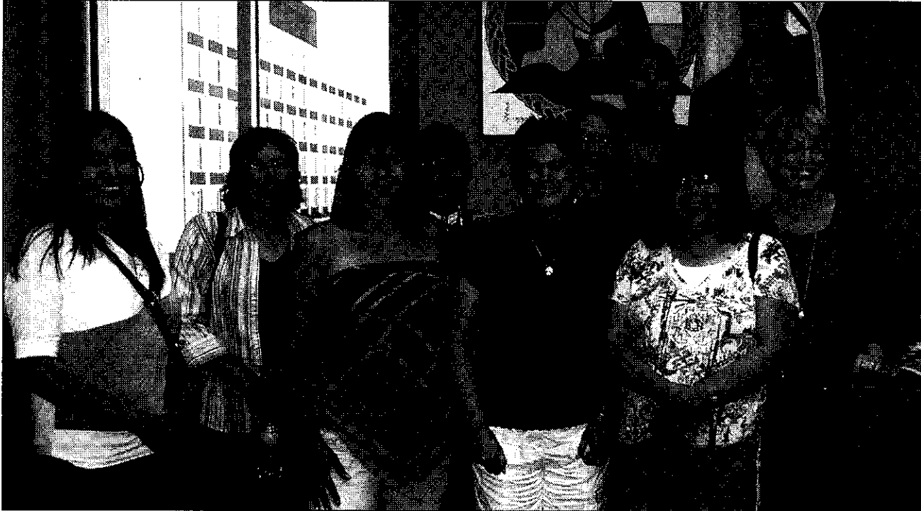
Students from Lakehead University's Aboriginal Education Program attended a civic literacy course at Thunder Bay's City Hall. The students plan to bring that information to the schools in communities they teach in in the future.