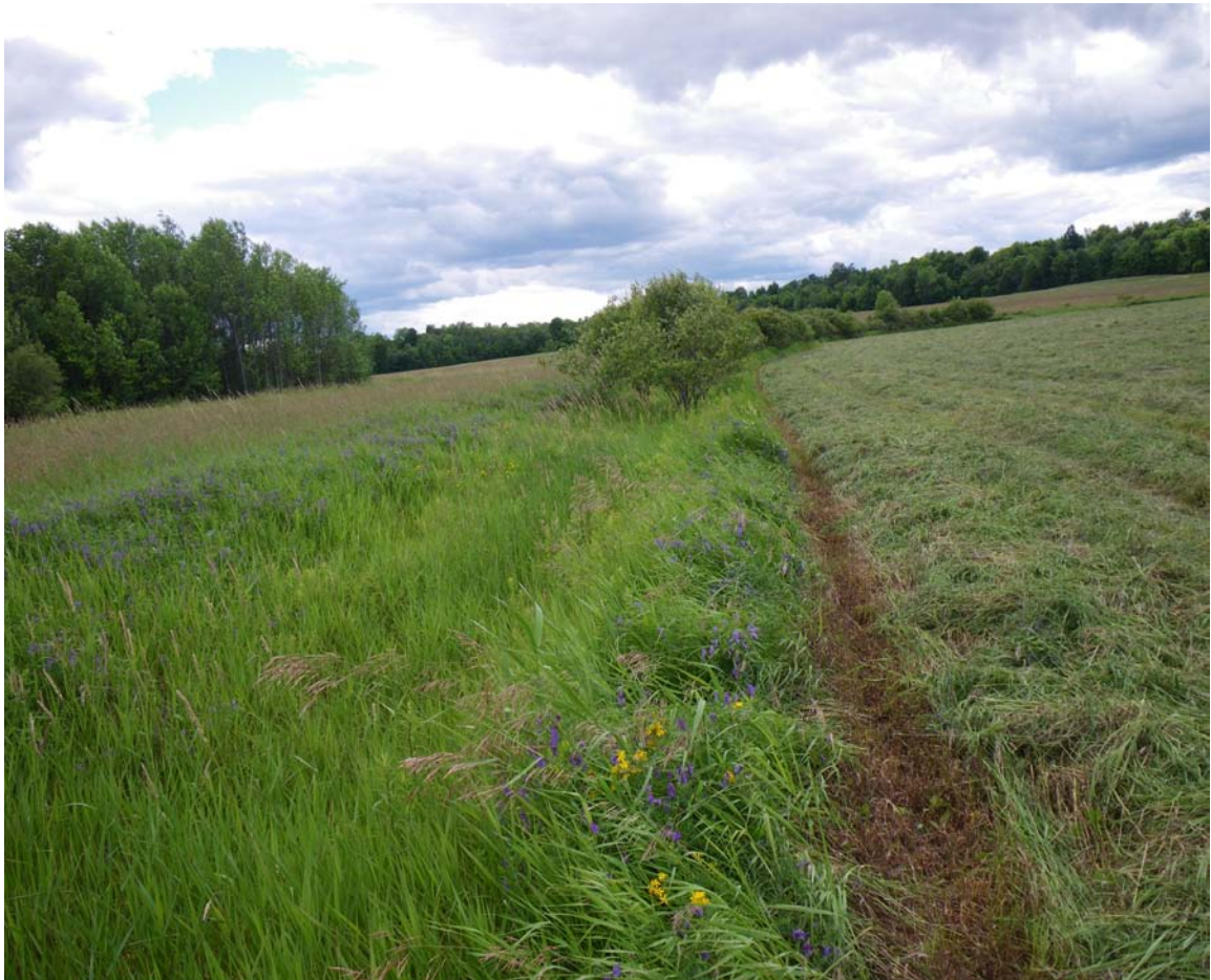
Figure 4.3 View of the Eastern Portion of Watercourse C, Facing West

The site investigation confirmed that Watercourse C is an intermittent stream. The average annual high water mark was determined to be the edge of the naturally vegetated riparian corridor through the surrounding agricultural fields, as shown in Figure 4.1. The proposed development area will occur within 30 to 120 m of the average annual high water mark of Watercourse C (Figure 4.1), therefore, an EIS will be required to assess potential adverse effects and mitigation and monitoring measures.