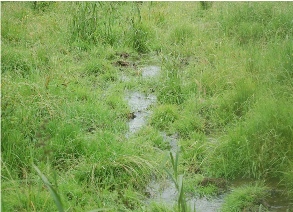
Figure 4.4 View of a Flooded Portion of Watercourse D

Watercourse D meanders west-east through the northeastern portion of the Project site and appears to be man-made as it originates in the middle of the agricultural field, west of the Project site. This is an intermittent watercourse that receives flow after heavy precipitation events and is dry the remaining months of the year. It is less than 1 m in width and follows a natural contour before draining into a catch basin located along the eastern boundary of the Project site. This watercourse flows southeast through the agricultural field through a naturally cut channel as it moves downstream. This watercourse is surrounded by a wet meadow marsh community that is dominated by grasses, sedges, rushes, herbs and shrubs. The soils in this area are shallow and areas of exposed bedrock were observed throughout. This area is also used as cattle pasture and a majority of this area is tilled.