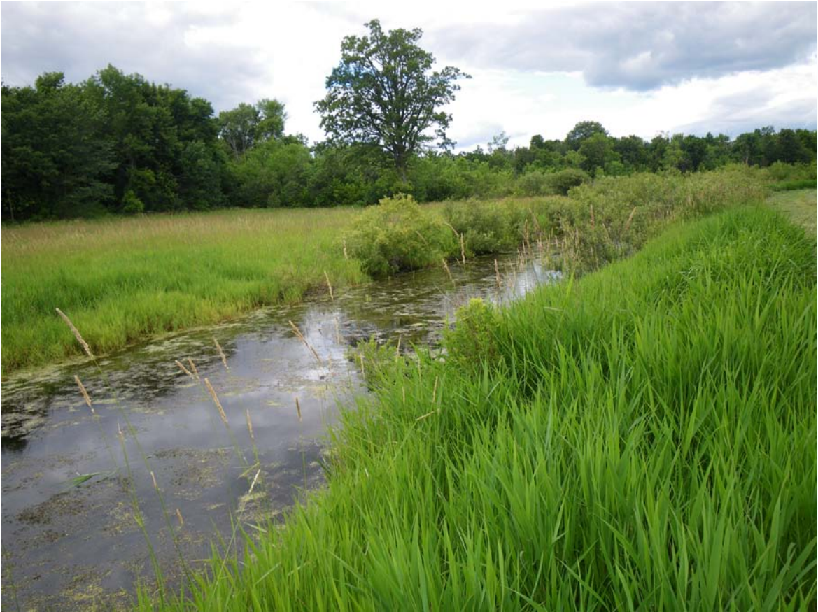
Figure 4.2 View of the Northern Portion of Watercourse B

The site investigation has confirmed that Watercourse B is a permanent stream. The average annual high water mark was assessed during the site investigation as the top of bank of the excavated drainage channel in the upstream reaches, but as the extent of vegetation tolerant of annual inundation in the lower gradient wetland reaches (Figure 4.1).