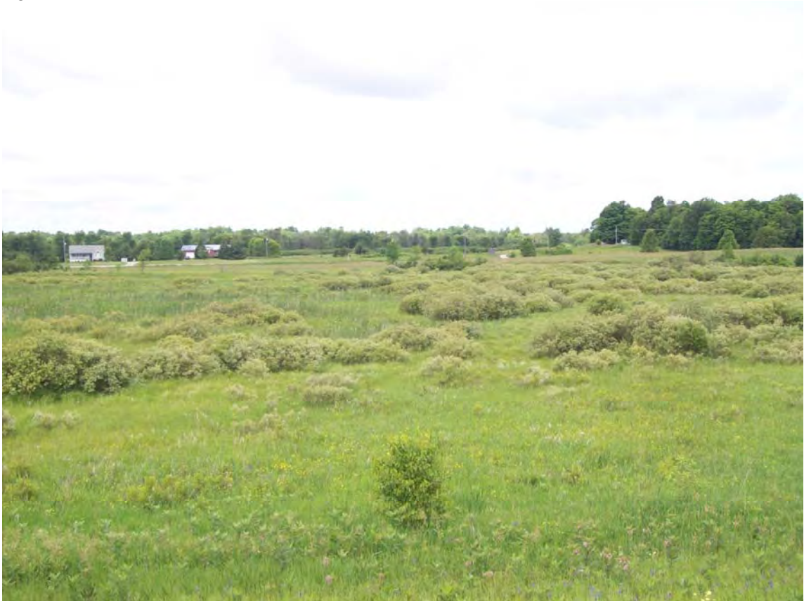
Figure 4.5 Photograph of Shrub Thicket and Cattail Marsh Surrounding Tributary C where it Flows onto the Project Site

A photograph of the shrub thicket where Tributary C enters the Project site is provided in Figure 4.5.