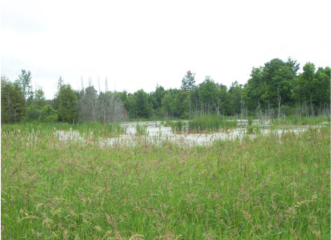
Figure 4.4 Photograph of On-line Open Water Marsh on Tributary B on the Project Site

The reach of Tributary B flowing through the Project site appears to provide a number of ecological functions including provision of habitat for aquatic and wetland wildlife, including species of birds, mammals, reptiles and amphibians, as well as fish and benthic invertebrates. Additional discussion on wildlife habitat is provided in the Natural Heritage Site Investigations Report (Hatch Ltd., 2010b). The tributary and associated wetlands would also serve to regulate hydrology in the downstream watercourses (including Tributary A and Grant's Creek), both through storm flow attenuation due to the storage in the wetlands, and provision of baseflow during lower flow periods due to slow release from the wetlands. The wetlands and surrounding riparian areas would also protect surface water quality in downstream reaches by buffering surface water runoff from adjacent areas.