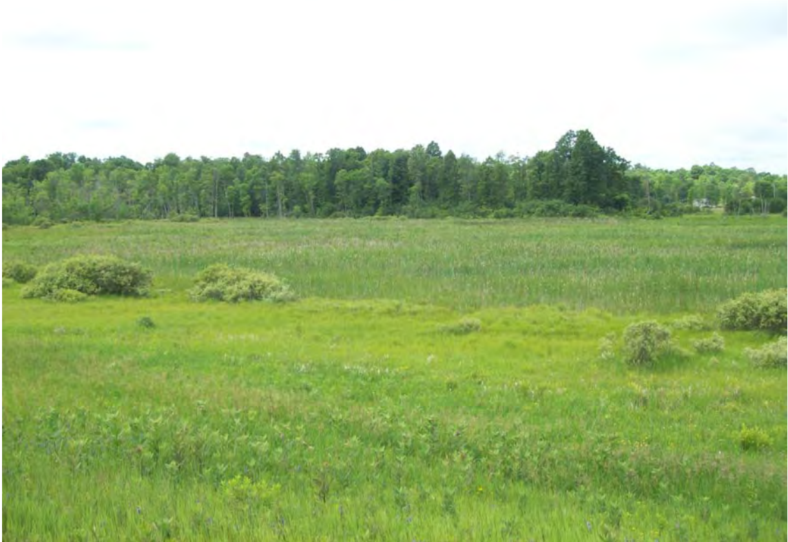
Figure 4.3 Photograph of Large Cattail Marsh on Tributary A on the Project Site – View Toward Northwest

After flowing out of the pond, Tributary A flows into an expansive marsh, dominated primarily by cattails ( Typha sp. ) in the area surrounding the tributary channel. A photograph of the cattail marsh on Tributary A in the northwest corner of the Project site is provided in Figure 4.3.