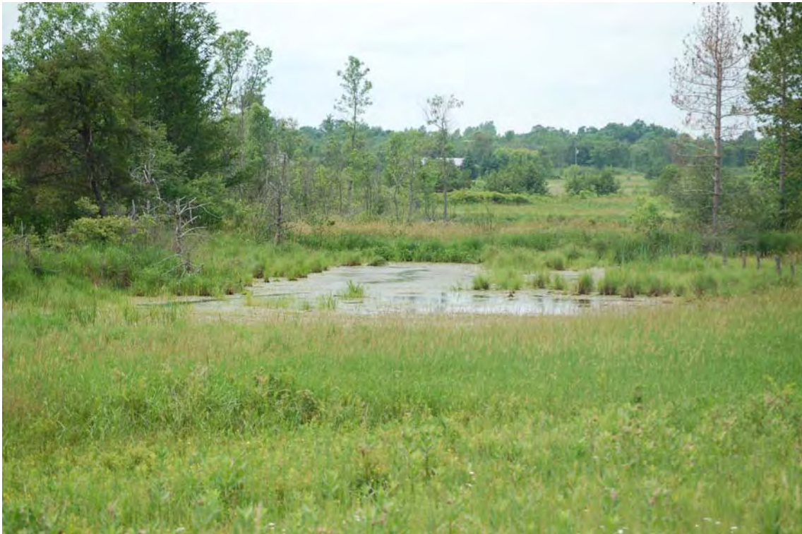
Figure 4.2 Photograph of On-line Pond on Tributary A on the Project Site

Before flowing onto the Project site, Tributary A runs through several wooded areas and a large open wetland immediately adjacent to the western Project boundary. It enters a wooded area on the Project site and flows for approximately 300 m before emerging into an open wetland with a large on-line pond, created by a beaver dam across the tributary. The pond is approximately 20 m wide by 60 m long. It is surrounded by a hummocky meadow marsh comprised of a variety of grasses [e.g., Canada blue-joint ( Calamagrostis canadensis )], sedges and forbs. There is dense submergent and floating leaved vegetation throughout much of the open water area. A photograph of the pond and surrounding wetland vegetation is provided in Figure 4.2.