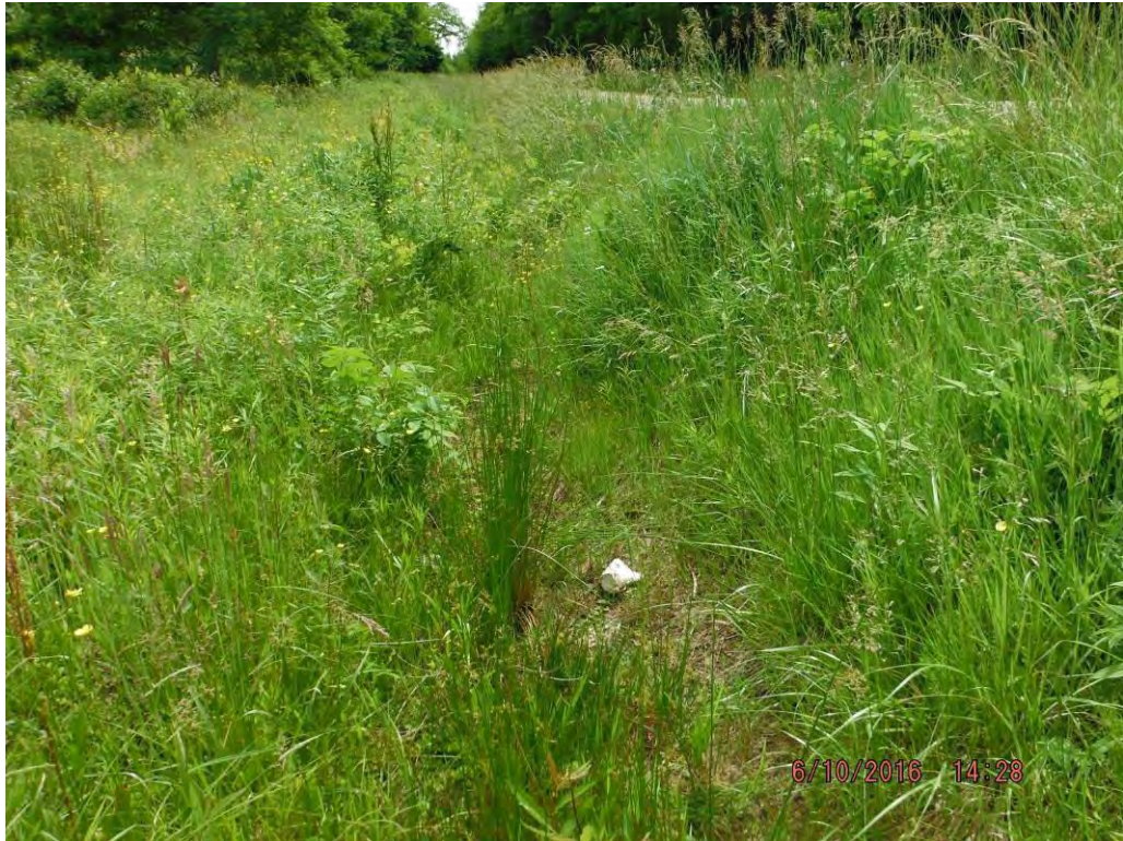
Photo No. 494 Data Point 776 Facing North / Downstream Description: Ditch Data Point for Jurisdictional Ditch A510.

Photo No. 493 Data Point 776 Facing South / Upstream Description: Ditch Data Point for Jurisdictional Ditch A510.