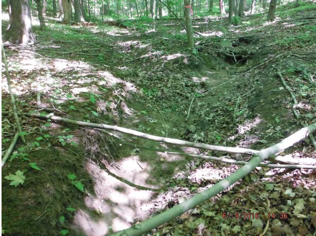
Photo No. 466 Data Point 761 Facing West / Downstream Description: Stream Data Point for Stream A539.

Photo No. 465 Data Point 761 Facing East / Upstream Description: Stream Data Point for Stream A539.