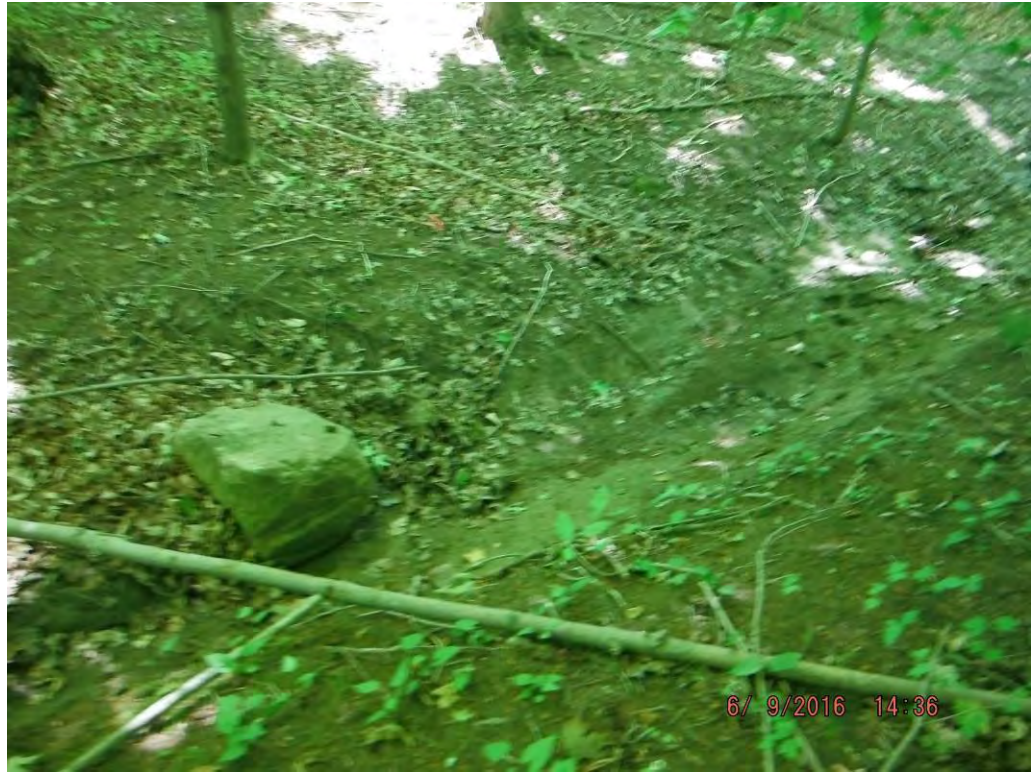
Photo No. 468 Data Point 762 Facing East / Upstream Description: Stream Data Point for Stream A540.

Photo No. 467 Data Point 761 Facing South / Right Bank to Left Bank Description: Stream Data Point for Stream A539.