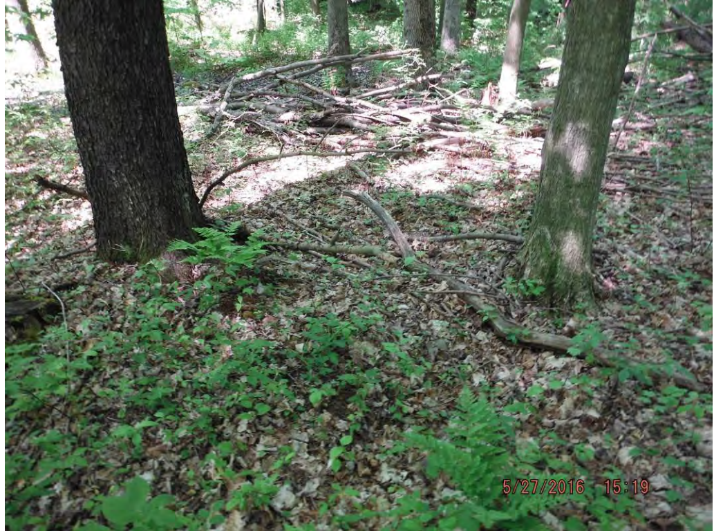
Photo No. 432 Data Point 728 Facing North Description: Overview of Wetland A627 from PFO Data Point 728.

Photo No. 431 Data Point 727 Facing North Description: Overview of Uplands adjacent to Wetland A626 from Data Point 727.