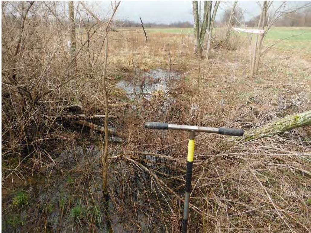
Photo No. 504 Data Point 785A Facing East Description: Overview of Wetland A646 from PEM Data Point 785.

Photo No. 503 Data Point 784A Facing West Description: PSS Wetland Data Point for Wetland A646.