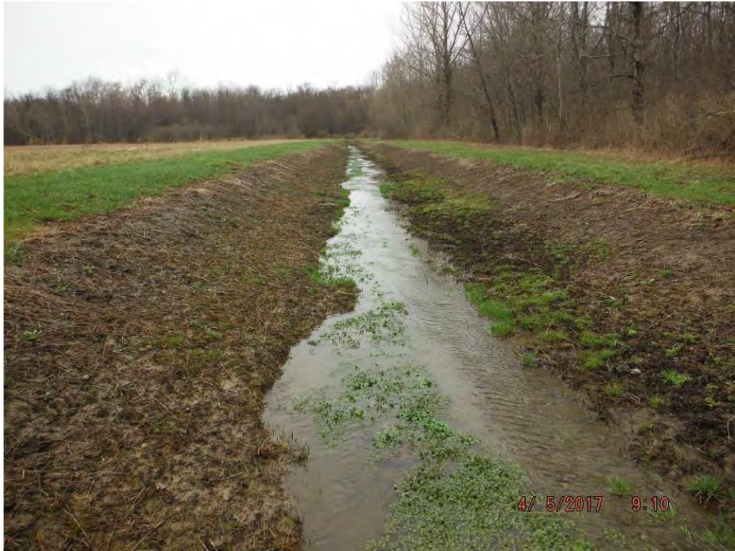
Photo No. 520 Data Point 801 Facing East / Left Bank to Right Bank Description: Ditch Data Point for Ditch A608.

Photo No. 519 Data Point 801 Facing North / Downstream Description: Ditch Data Point for Ditch A608.