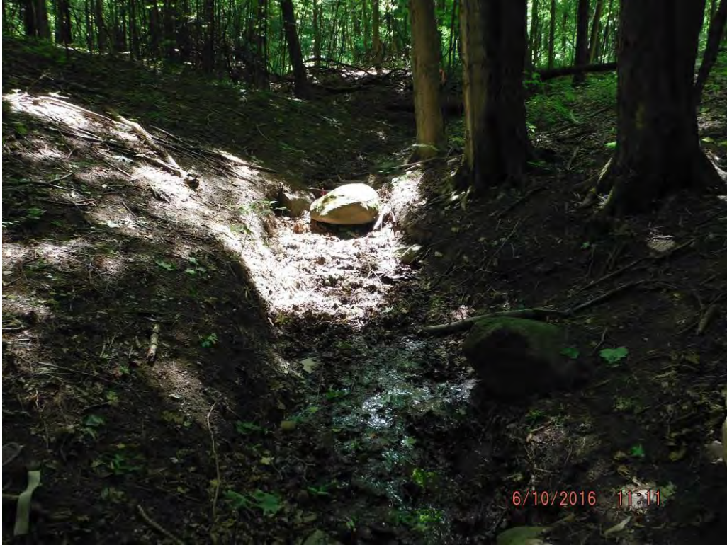
Photo No. 488 Data Point 771 Facing North / Downstream Description: Stream Data Point for Stream A545.

Photo No. 487 Data Point 771 Facing South / Upstream Description: Stream Data Point for Stream A545.