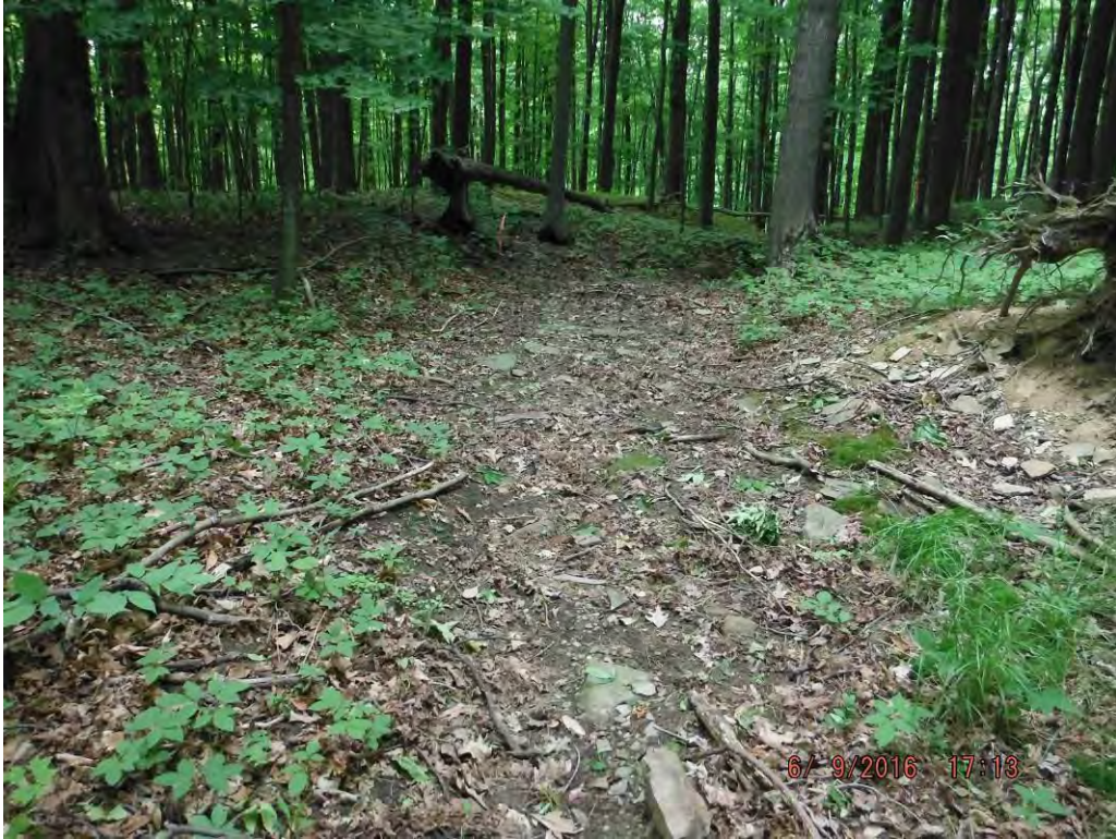
Photo No. 478 Data Point 766 Facing East / Right Bank to Left Bank Description: Stream Data Point for Stream A542.

Photo No. 477 Data Point 766 Facing North / Downstream Description: Stream Data Point for Stream A542.