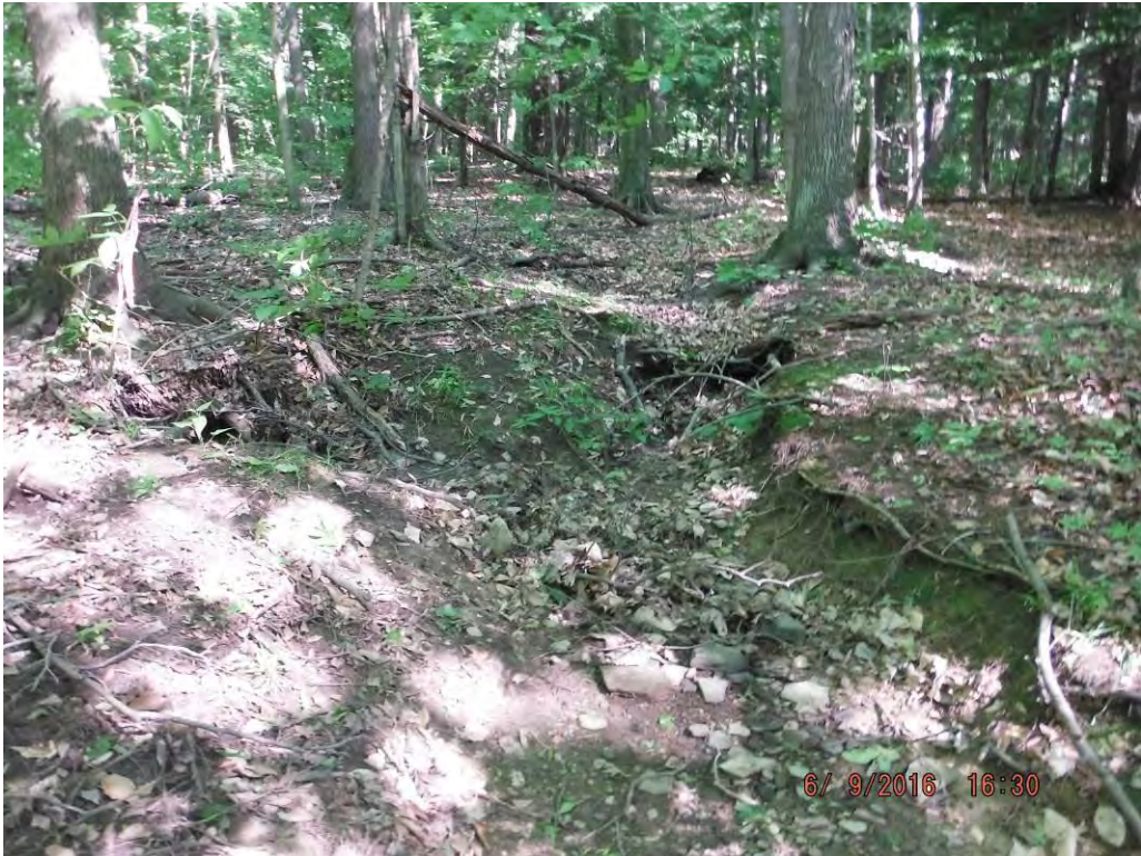
Photo No. 474 Data Point 765 Facing West / Downstream Description: Stream Data Point for Stream A541.

Photo No. 473 Data Point 765 Facing East / Upstream Description: Stream Data Point for Stream A541.