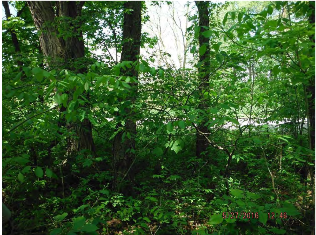
Photo No. 428 Data Point 724 Facing West Description: PEM Wetland Data Point 724 for Wetland A625.

Photo No. 427 Data Point 723 Facing West Description: Overview of Uplands adjacent to Wetland A624 from Data Point 723.