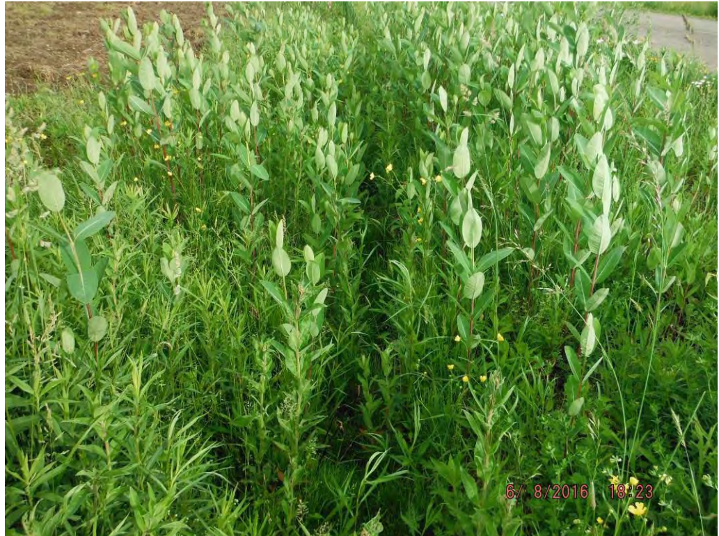
Photo No. 456 Data Point 754 Facing North / Downstream Description: Ditch Data Point for Jurisdictional Ditch A507.

Photo No. 455 Data Point 754 Facing South / Upstream Description: Ditch Data Point for Jurisdictional Ditch A507.