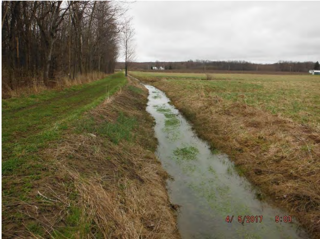
Photo No. 516 Data Point 800 Facing West / Downstream Description: Ditch Data Point for Ditch A607.

Photo No. 515 Data Point 800 Facing East / Upstream Description: Ditch Data Point for Ditch A607.