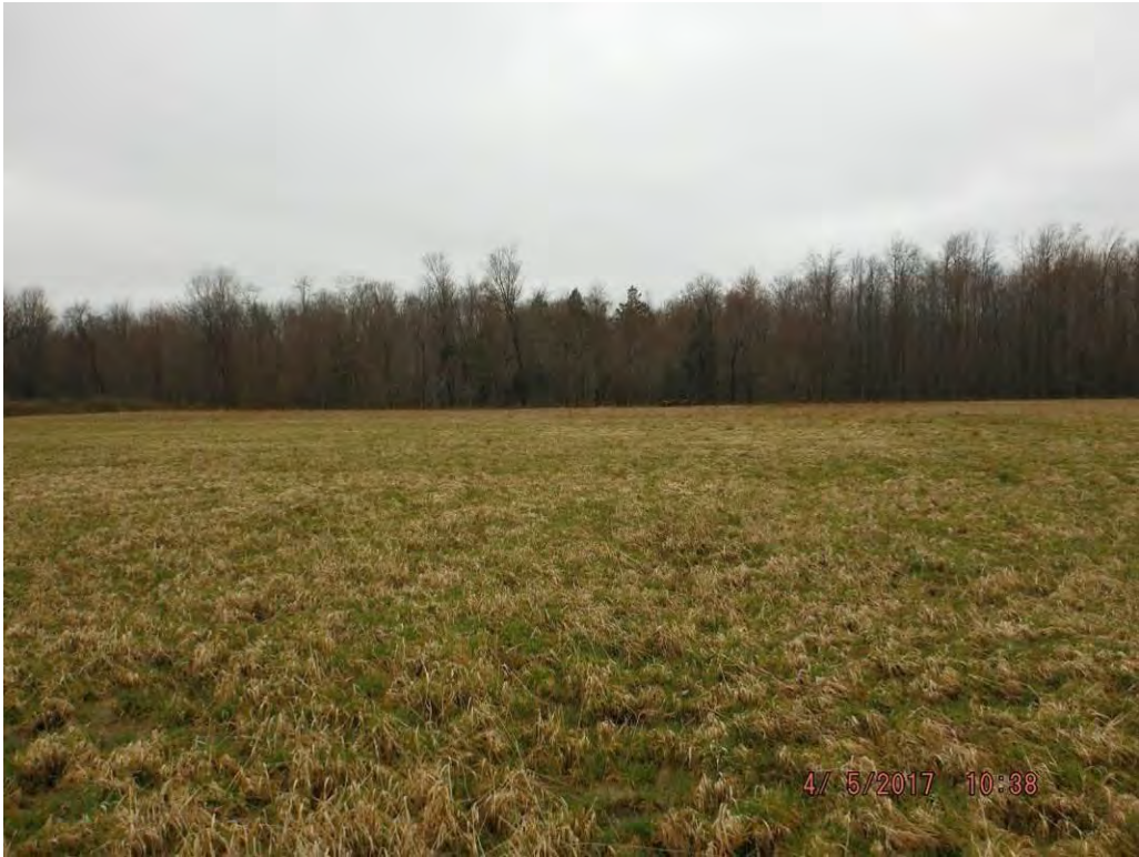
Photo No. 524 Data Point 805 Facing East / Upstream Description: Ditch Data Point for Ditch A609.

Photo No. 523 Data Point 804 Facing West Description: Overview of Uplands adjacent to Wetland A650 and Wetland A651.