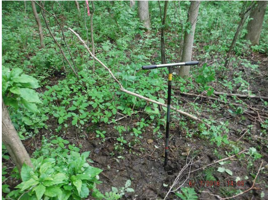
Photo No. 442 Data Point 741 Facing West Description: Overview of Uplands adjacent to Wetland A634 from Data Point 741.

Photo No. 441 Data Point 740 Facing West Description: Overview of Wetland A634 from PFO Data Point 740.