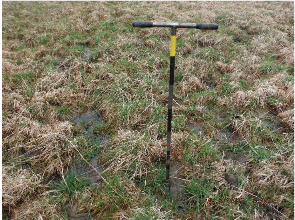
Photo No. 522 Data Point 803 Facing North Description: Overview of Wetland A651 from PEM Data Point 803.

Photo No. 521 Data Point 802 Facing South Description: PEM Wetland Data Point 802 for Wetland A650.