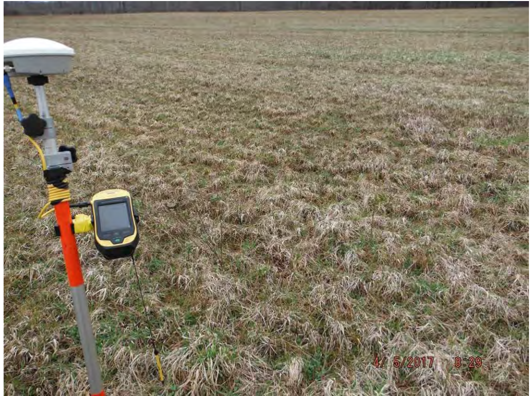
Photo No. 514 Data Point 799 Facing South Description: Overview of Wetland A649 from PEM Data Point 799.

Photo No. 513 Data Point 798 Facing West Description: Upland Dat Point 798 adjacent to Wetland A648 and Wetland A649.