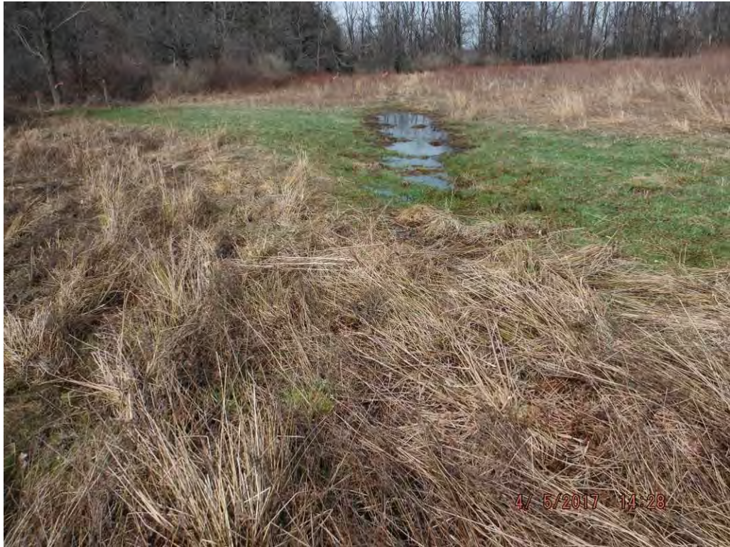
Photo No. 528 Data Point 807 Facing West Description: Overview of Uplands adjacent to Wetland A652 from Data Point 807.

Photo No. 527 Data Point 806 Facing North Description: Overview of Wetland A652 from PEM Data Point 806.