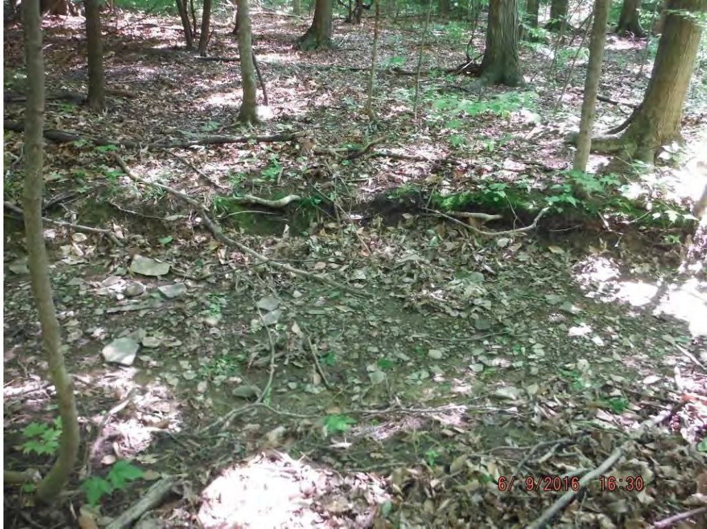
Photo No. 476 Data Point 766 Facing South / Upstream Description: Stream Data Point for Stream A542.

Photo No. 475 Data Point 765 Facing South / Right Bank to Left Bank Description: Stream Data Point for Stream A541.