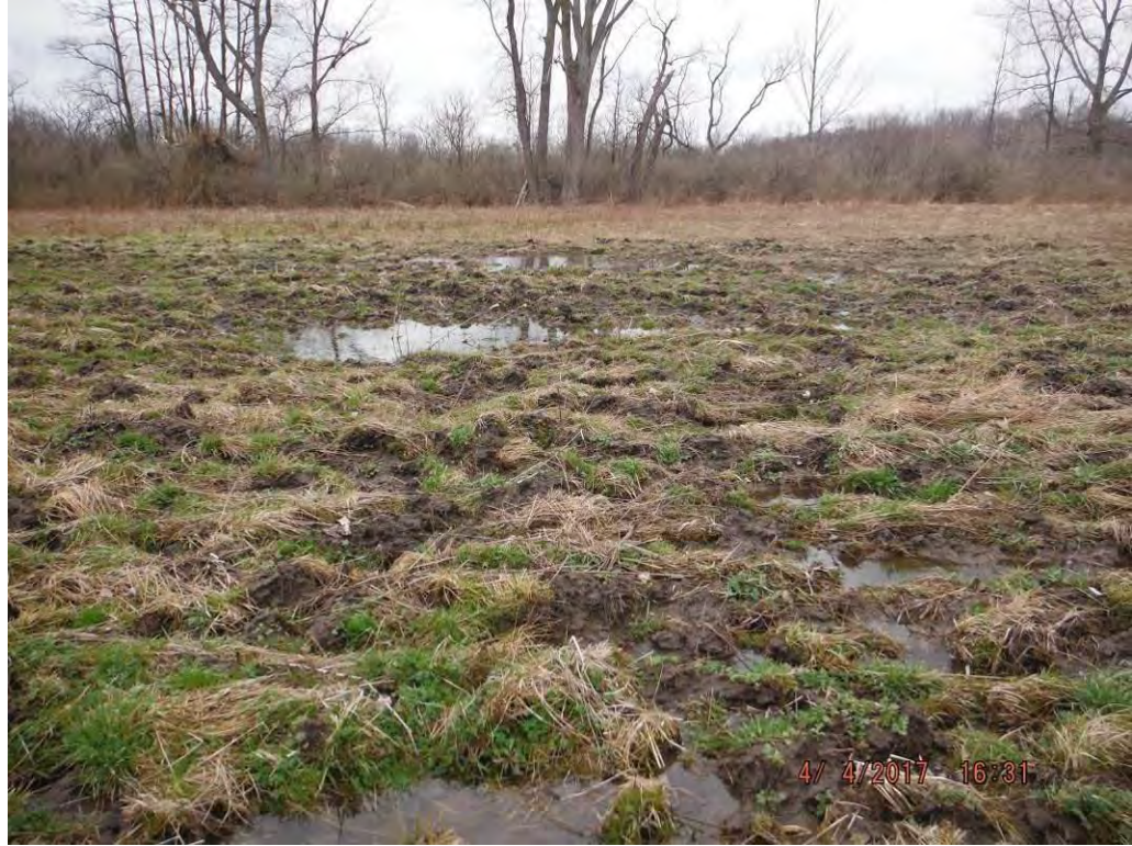
Photo No. 512 Data Point 797 Facing North Description: Overview of Wetland A648 from PEM Data Point 797.

Photo No. 511 Data Point 796 Facing West Description: Overview of Wetland A643 from PEM Data Point 796.