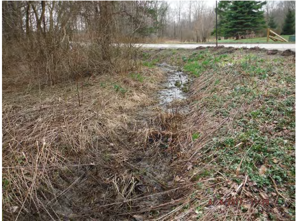
Photo No. 526 Data Point 805 Facing North / Left Bank to Right Bank Description: Ditch Data Point for Ditch A609.

Photo No. 525 Data Point 805 Facing West / Downstream Description: Ditch Data Point for Ditch A609.