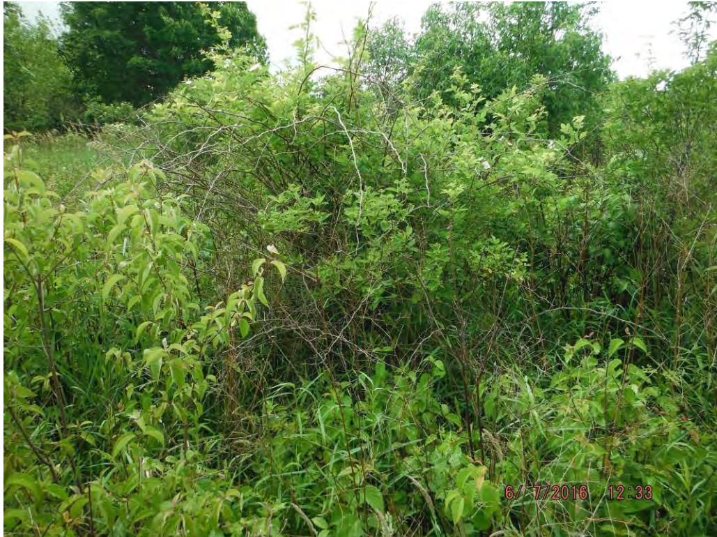
Photo No. 440 Data Point 739 Facing North Description: Upland Data Point 739 for Wetland A633.

Photo No. 439 Data Point 738 Facing South Description: Overview of Wetland A633 from PSS Data Point 738.