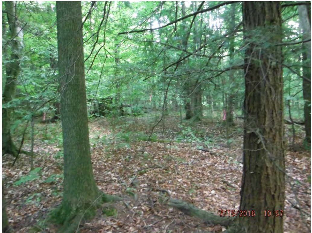
Photo No. 500 Data Point 783A Facing North / Upstream Description: Ditch Data Point for Ditch A600.

Photo No. 499 Data Point 784 Facing East Description: Overview of Uplands adjacent to Wetland A645 from Data Point 784.