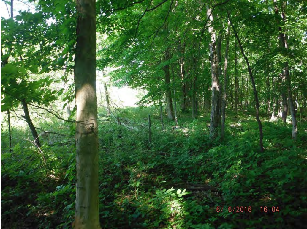
Photo No. 438 Data Point 734 Facing East Description: PEM Wetland Data Point 734 for Wetland A630.

Photo No. 437 Data Point 733 Facing East Description: Overview of Uplands adjacent to Wetland A629 from Data Point 733.