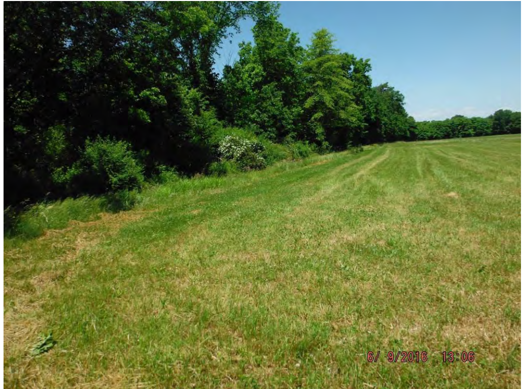
Photo No. 462 Data Point 760 Facing East / Upstream Description: Ditch Data Point for Jurisdictional Ditch A509.

Photo No. 461 Data Point 759 Facing North Description: Overview of Uplands adjacent to Wetland A638 from Data Point 759.