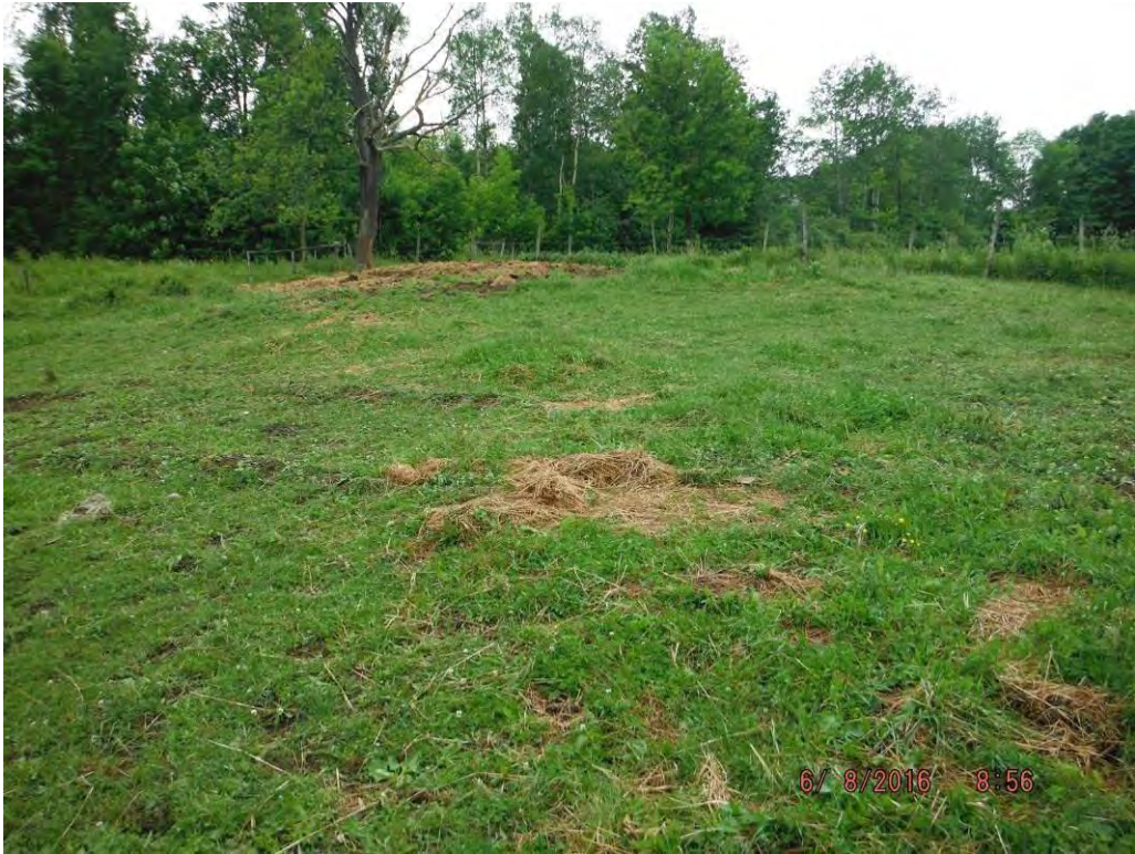
Photo No. 450 Data Point 750 Facing West / Upstream Description: Stream Data Point for Stream A538.

Photo No. 449 Data Point 749 Facing South Description: Overview of Uplands adjacent to Wetland A635B from Data Point 749.