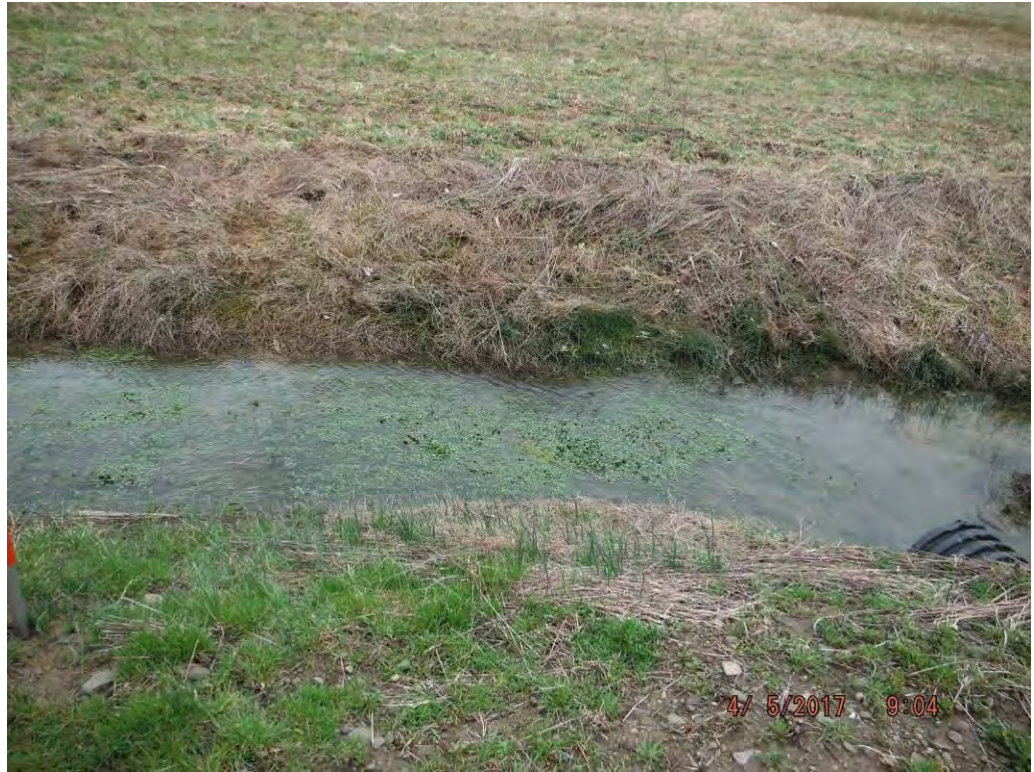
Photo No. 518 Data Point 801 Facing South / Upstream Description: Ditch Data Point for Ditch A608.

Photo No. 517 Data Point 800 Facing South / Right Bank to Left Bank Description: Ditch Data Point for Ditch A607.