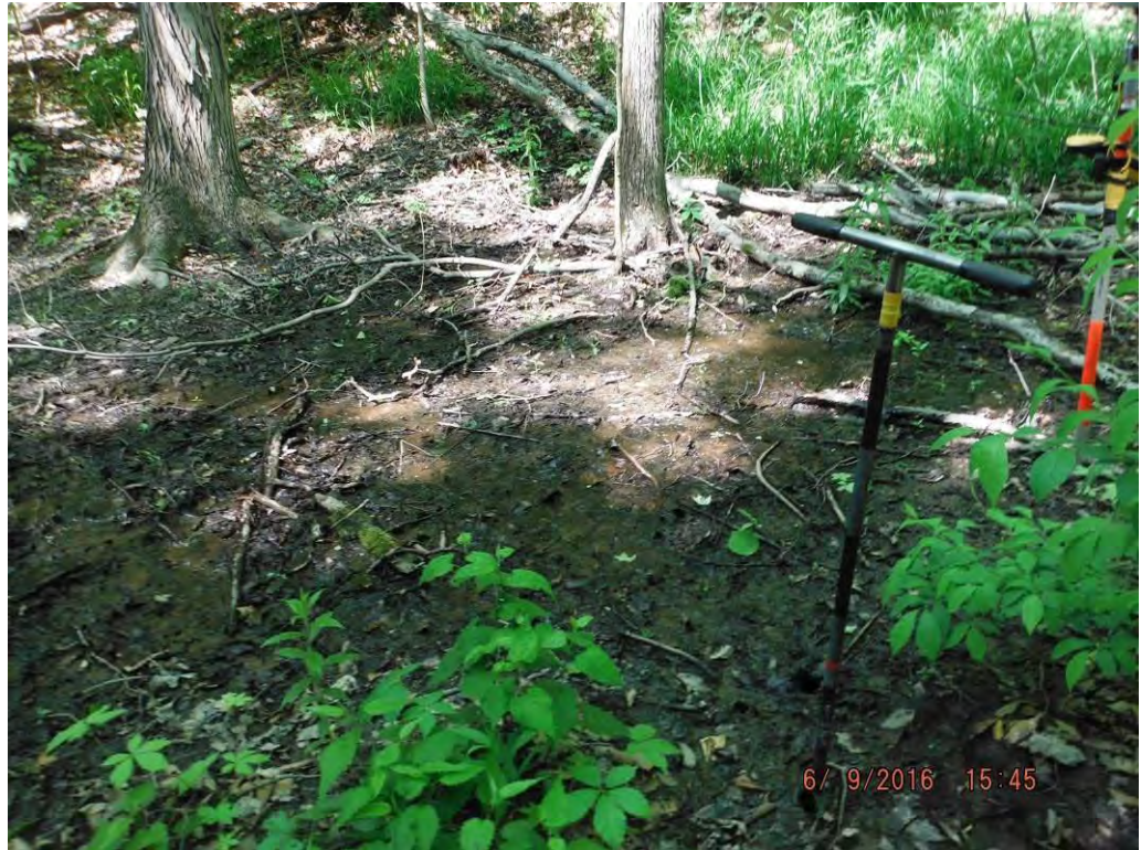
Photo No. 472 Data Point 764 Facing North Description: Overview of Uplands adjacent to Wetland A639 from Data Point 769.

Photo No. 471 Data Point 763 Facing North Description: PFO Wetland Data Point for Wetland A639.