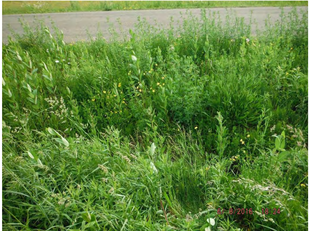
Photo No. 458 Data Point 755 Facing South Description: PEM Data Point 755 for Wetland A587.

Photo No. 457 Data Point 754 Facing West / Right Bank to Left Bank Description: Ditch Data Point for Jurisdictional Ditch A507.