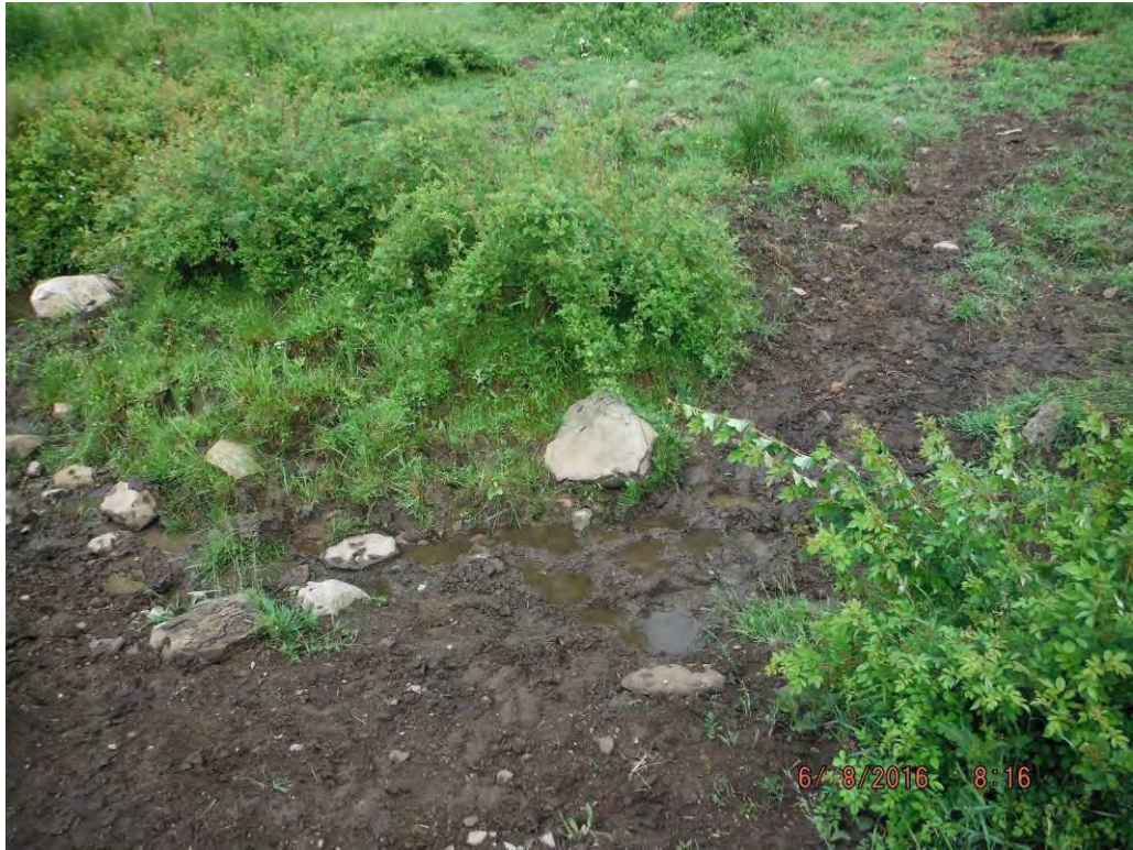
Photo No. 448 Data Point 748 Facing East Description: Overview of Wetland A635B from PEM Data Point 748.

Photo No. 447 Data Point 747 Facing West / Right Bank to Left Bank Description: Stream Data Point for Stream A537.