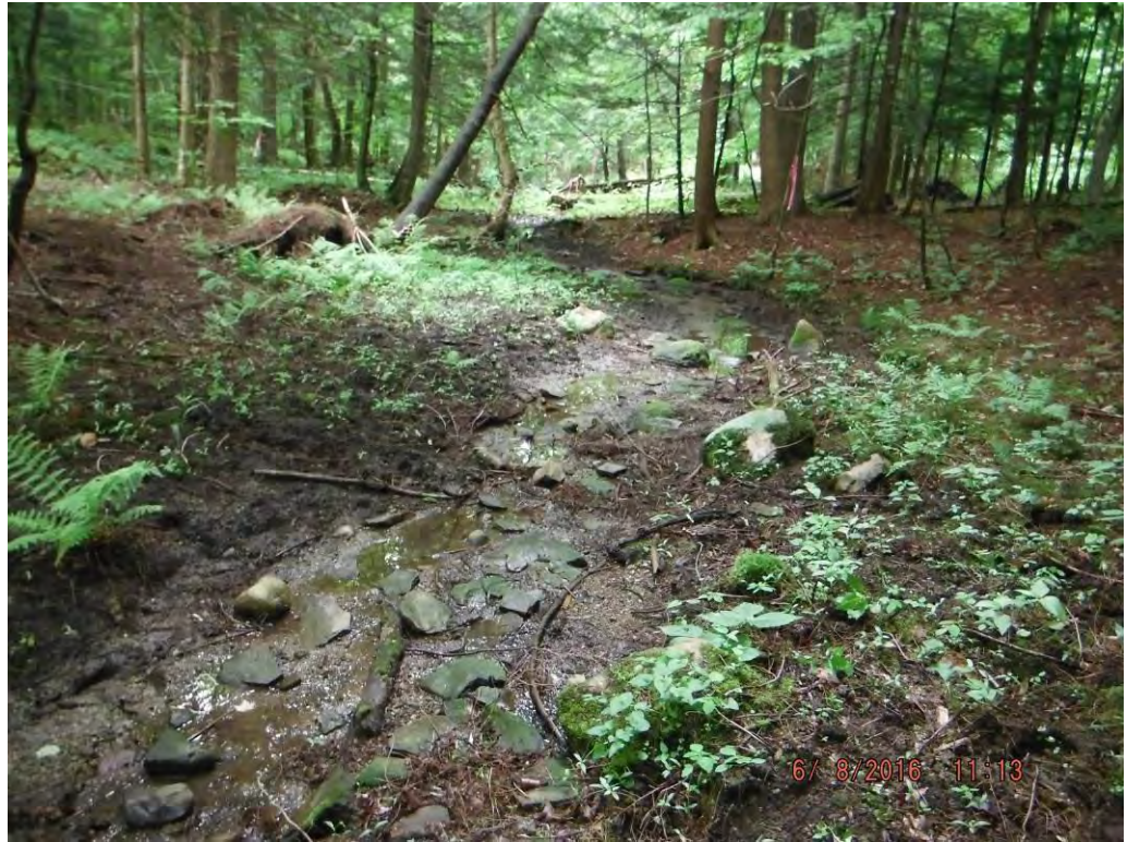
Photo No. 452 Data Point 750 Facing North / Right Bank to Left Bank Description: Stream Data Point for Stream A538.

Photo No. 451 Data Point 750 Facing East / Downstream Description: Stream Data Point for Stream A538.