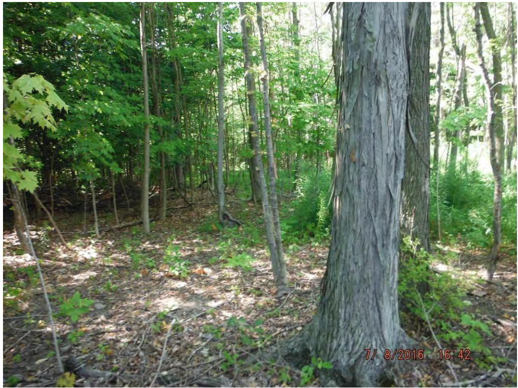
Photo No. 498 Data Point 783 Facing East Description: Overview of Wetland A645 from PEM Data Point 773.

Photo No. 497 Data Point 778 Facing West Description: Overview of Uplands adjacent to Wetland A643 from Data Point 778.