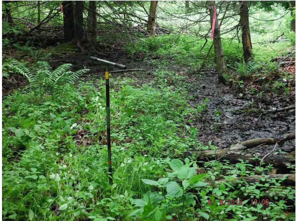
Photo No. 454 Data Point 752 Facing South Description: Overview of Uplands adjacent to Wetland A636 from Data Point 752.

Photo No. 453 Data Point 751 Facing East Description: PEM Data Point 751 for Wetland A636.