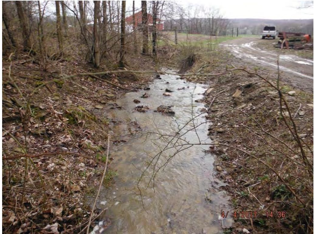
Photo No. 510 Data Point 794 Facing South / Right Bank to Left Bank Description: Stream Data Point for Stream A700.

Photo No. 509 Data Point 794 Facing West / Downstream Description: Stream Data Point for Stream A700.