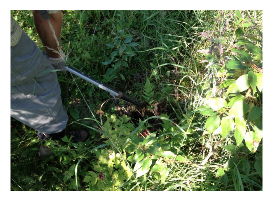
Plate 2 : Shows conditions for test pit survey. Note black saturated soils.