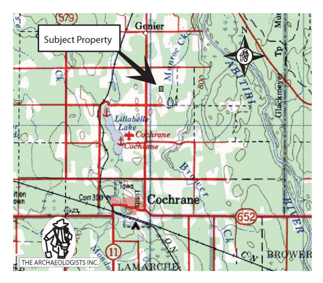
Map 1: General location of subject property.