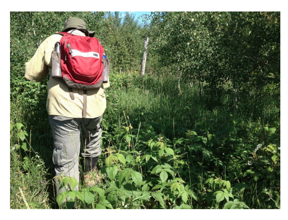
Plate 1: Shows conditions appropriate for test pit survey.