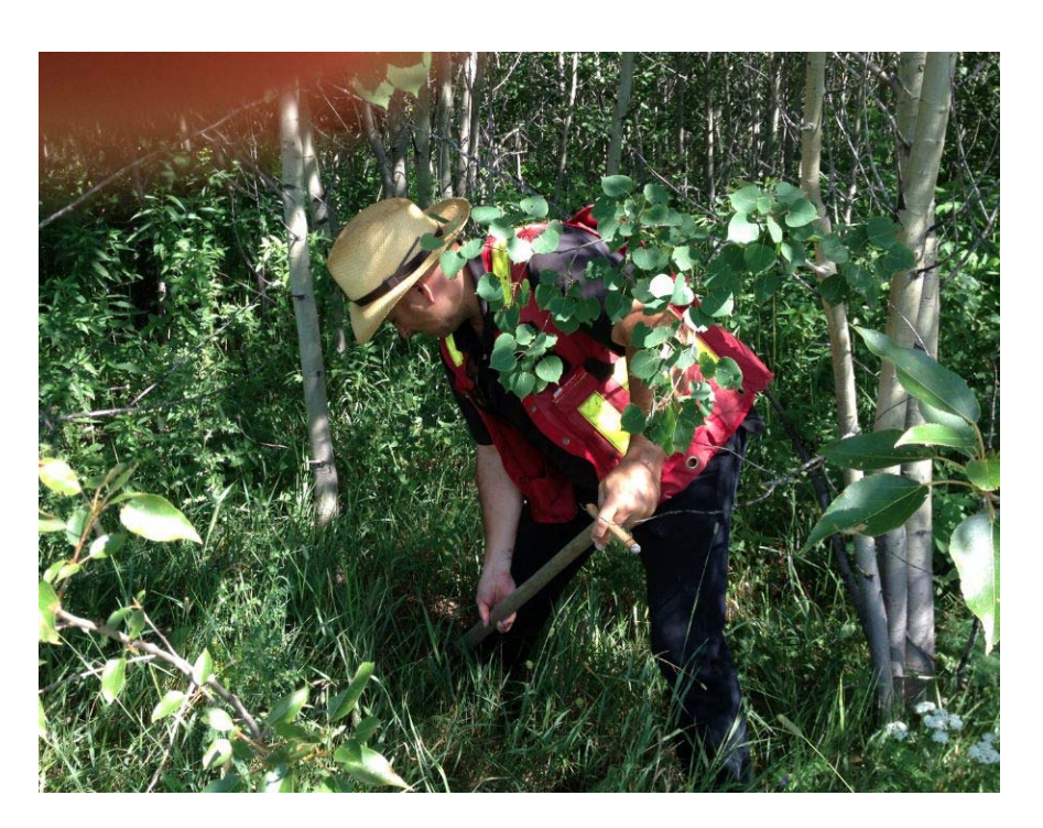
Plate 4: Shows conditions appropriate for test pit survey.