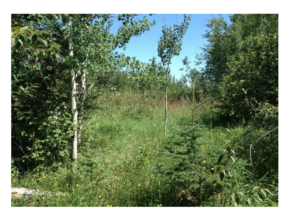
Plate 3: Shows conditions appropriate for test pit survey.