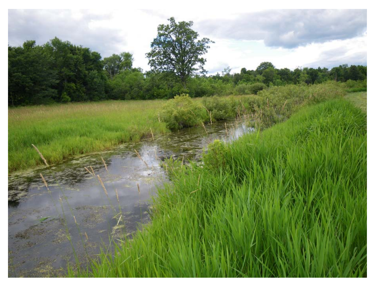
Figure 4.2 View of the Northern Portion of Watercourse B

The site investigation has confirmed that Watercourse B is a permanent stream. The average annual high water mark was assessed during the site investigation as the top of bank of the excavated drainage channel in the upstream reaches, but as the extent of vegetation tolerant of annual inundation in the lower gradient wetland reaches (Figure 4.1).