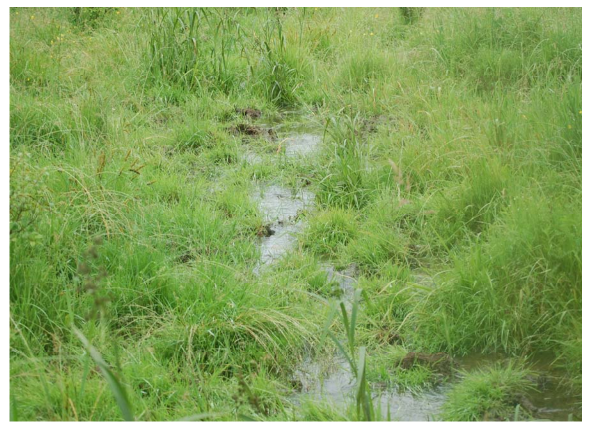
Figure 4.4 View of a Flooded Portion of Watercourse D

Watercourse D meanders west-east through the northeastern portion of the Project site and appears to be man-made as it originates in the middle of the agricultural field, west of the Project site. This is an intermittent watercourse that receives flow after heavy precipitation events and is dry the remaining months of the year. It is less than 1 m in width and follows a natural contour before draining into a catch basin located along the eastern boundary of the Project site. This watercourse flows southeast through the agricultural field through a naturally cut channel as it moves downstream. This watercourse is surrounded by a wet meadow marsh community that is dominated by grasses, sedges, rushes, herbs and shrubs. The soils in this area are shallow and areas of exposed bedrock were observed throughout. This area is also used as cattle pasture and a majority of this area is tilled.