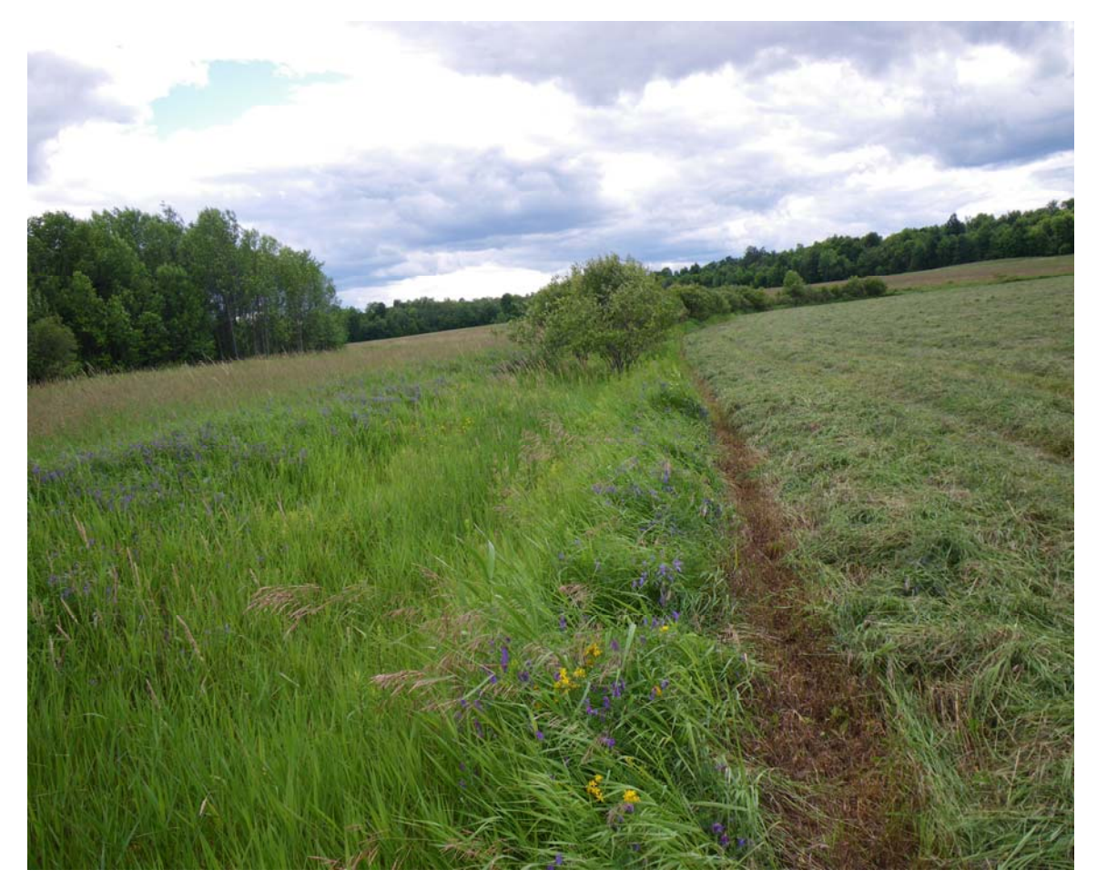
Figure 4.3 View of the Eastern Portion of Watercourse C, Facing West

The site investigation confirmed that Watercourse C is an intermittent stream. The average annual high water mark was determined to be the edge of the naturally vegetated riparian corridor through the surrounding agricultural fields, as shown in Figure 4.1. The proposed development area will occur within 30 to 120 m of the average annual high water mark of Watercourse C (Figure 4.1), therefore, an EIS will be required to assess potential adverse effects and mitigation and monitoring measures.