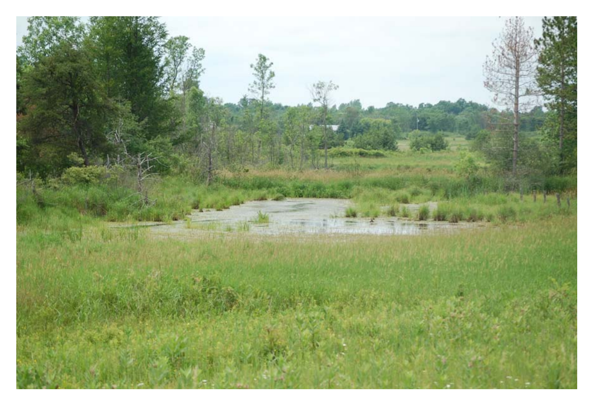
Figure 4.2 Photograph of On-line Pond on Tributary A on the Project Site

Before flowing onto the Project site, Tributary A runs through several wooded areas and a large open wetland immediately adjacent to the western Project boundary. It enters a wooded area on the Project site and flows for approximately 300 m before emerging into an open wetland with a large online pond, created by a beaver dam across the tributary. The pond is approximately 20 m wide by 60 m long. It is surrounded by a hummocky meadow marsh comprised of a variety of grasses [e.g., Canada blue-joint ( Calamagrostis canadensis )], sedges and forbs. There is dense submergent and floating leaved vegetation throughout much of the open water area. A photograph of the pond and surrounding wetland vegetation is provided in Figure 4.2.