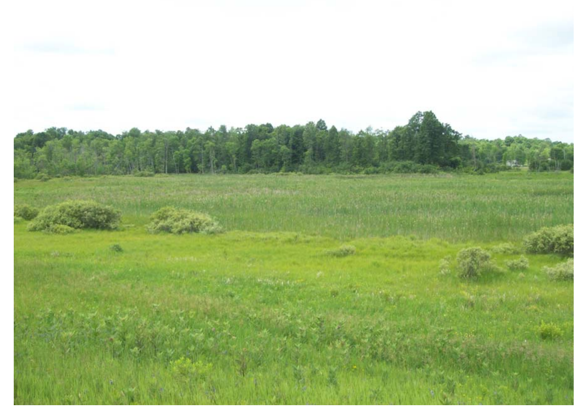
Figure 4.3 Photograph of Large Cattail Marsh on Tributary A on the Project Site – View Toward Northwest

After flowing out of the pond, Tributary A flows into an expansive marsh, dominated primarily by cattails ( Typha sp. ) in the area surrounding the tributary channel. A photograph of the cattail marsh on Tributary A in the northwest corner of the Project site is provided in Figure 4.3.