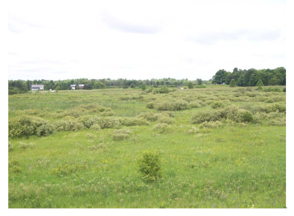
Figure 4.5 Photograph of Shrub Thicket and Cattail Marsh Surrounding Tributary C where it Flows onto the Project Site

A photograph of the shrub thicket where Tributary C enters the Project site is provided in Figure 4.5.