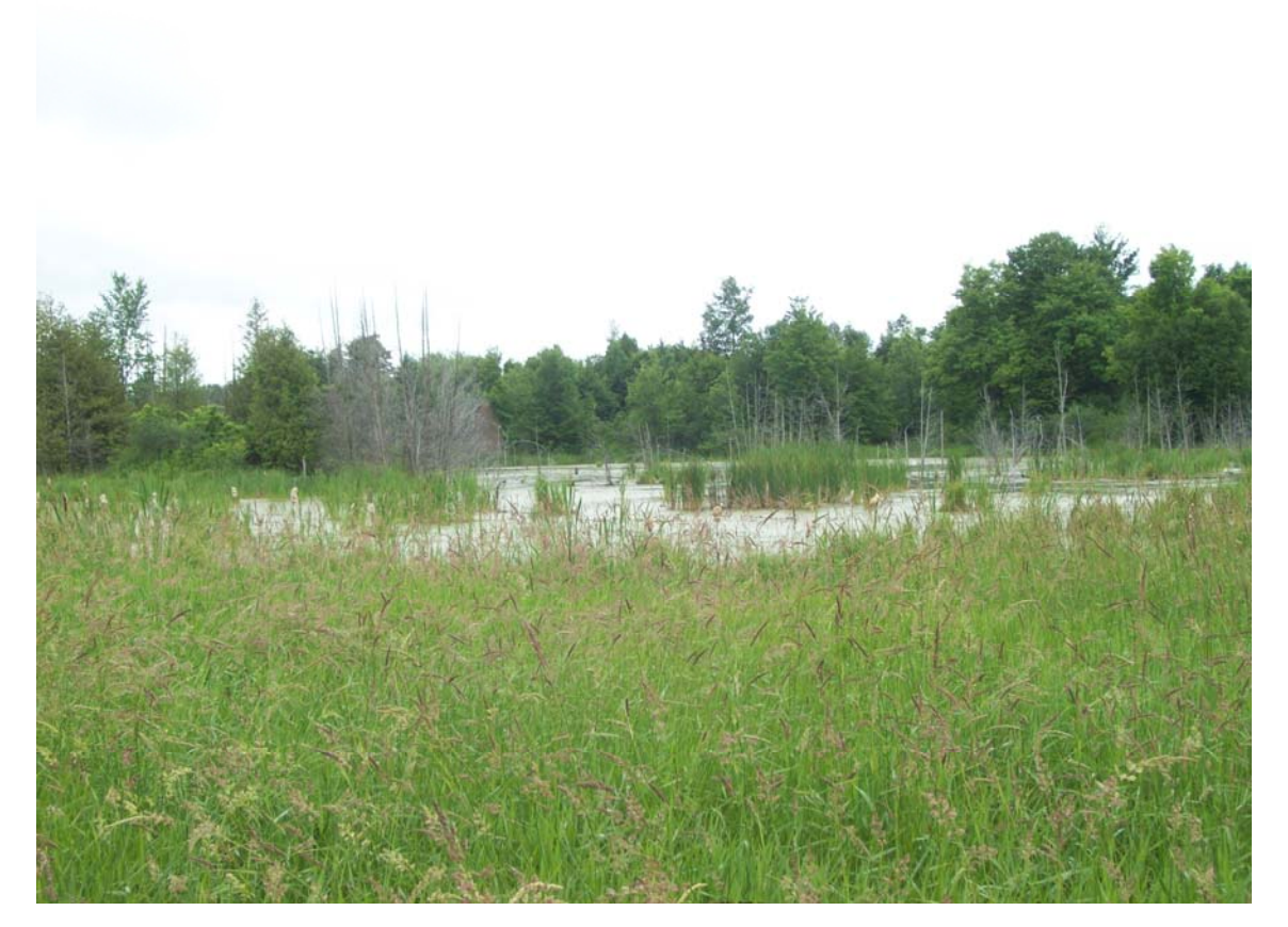
Figure 4.4 Photograph of On-line Open Water Marsh on Tributary B on the Project Site

The reach of Tributary B flowing through the Project site appears to provide a number of ecological functions including provision of habitat for aquatic and wetland wildlife, including species of birds, mammals, reptiles and amphibians, as well as fish and benthic invertebrates. Additional discussion on wildlife habitat is provided in the Natural Heritage Site Investigations Report (Hatch Ltd., 2010b). The tributary and associated wetlands would also serve to regulate hydrology in the downstream watercourses (including Tributary A and Grant's Creek), both through storm flow attenuation due to the storage in the wetlands, and provision of baseflow during lower flow periods due to slow release from the wetlands. The wetlands and surrounding riparian areas would also protect surface water quality in downstream reaches by buffering surface water runoff from adjacent areas.